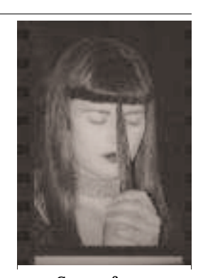
Scene from Blood Trance

M: Where did you find the music for Blood Trance ? It is quite wonderful!