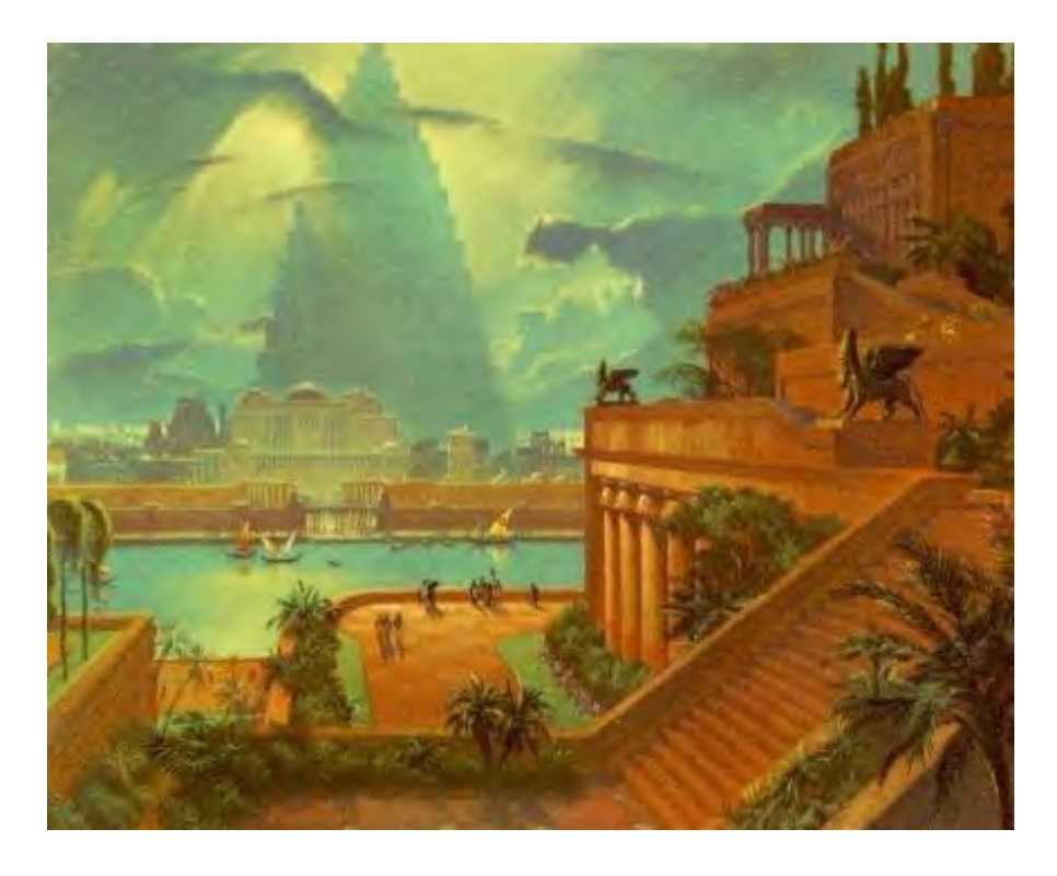
Reconstruction: The Hanging Gardens of Babylon (Iraq)

Based on Ark of the Christos: The Mythology, Symbolism and Prophecy of the Return of Planet X and the Age of Terror