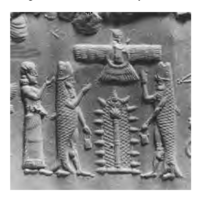
Sample of early cylinder seal.

What are they after? As in the example set by a recent robbery the monument robbers want knowledge. Thieves smashed the doors of an Iraqi museum and a glass display case, absconding with cuneiform tablets and cylinders from the 6th century B.C. They left behind gold jewelry that might have tempted amateurs. Cylinders from the 6<sup>th</sup> century B.C. are more valuable than gold for the information they record.