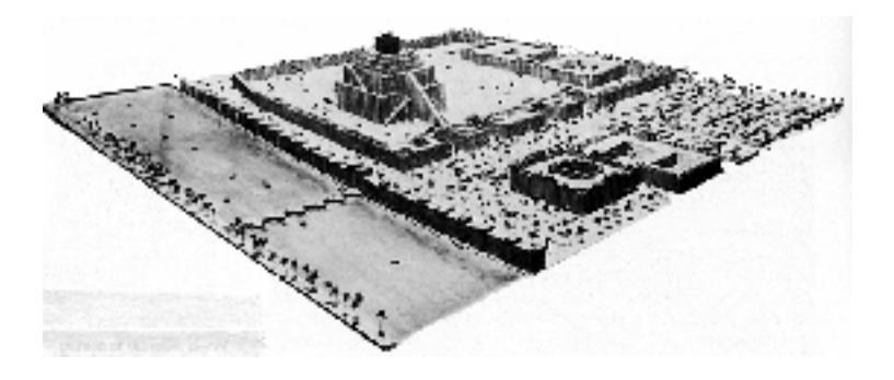
Model of Babylon.

On entering ancient Babylon the visitor passed the E-mah , the temple of the mother goddess Ninmah or Ninharsag , which has recently been restored by Saddam. <sup>18</sup> E-mah is a highly significant word. It is the Hebrew word for 'terror'. Beyond the Emah was Babylon's most important temple, the Esagila, the dwelling-place of the sun god Marduk, the Babylonian name for Planet X. Nebuchadnezzar says that he covered its wall with sparkling gold in order to make it shine like the sun. In this temple was found a chapel or sanctuary for Marduk's father, E.A, whom Zecharia Sitchin upholds as the genetic engineer responsible for the creation of humanity.