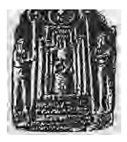
Anu entering the gateway to return to Planet X? © Z.Sitchin, When Time Began.

The device comes alive, the gate swings open and Anu and Antu enter the Abyss (sometimes called the Fish of Isis).