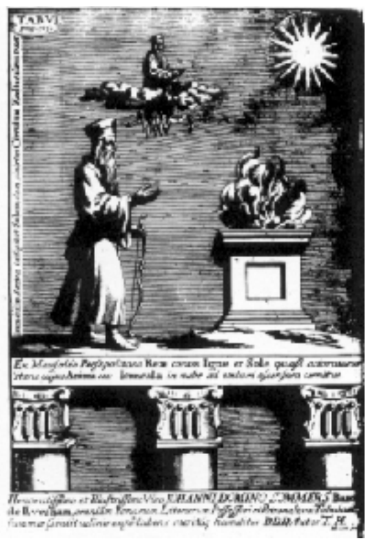
Ahura Mazda floating on a cloud above an Ark-like box.

This deduction that E.A. is the God of light of the Ark brings up another. There were two teachings of Moses. The first is the blue stone-based enlightenment teaching of E.A. The second, the Ten Commandments, a penal code for the Israelite slaves, is Enlil's, whose editors removed the mention of the enlightening blue stones from the biblical story.