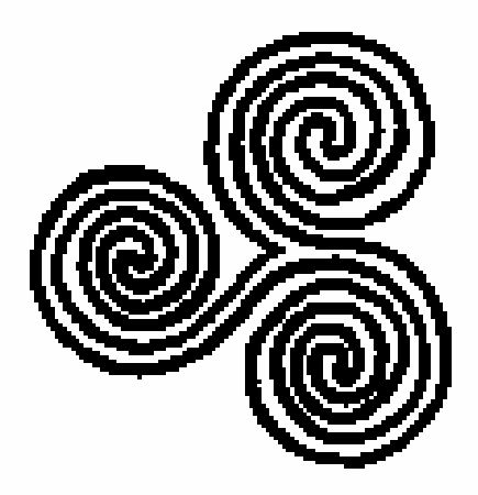
The three orbs appear as the triple spiral in Ireland.

That's why light burned through my veins as I shuttled between Sumerian, Irish and Cathar histories, pouring over currents of symbols and myths that criss-crossed these cultures.