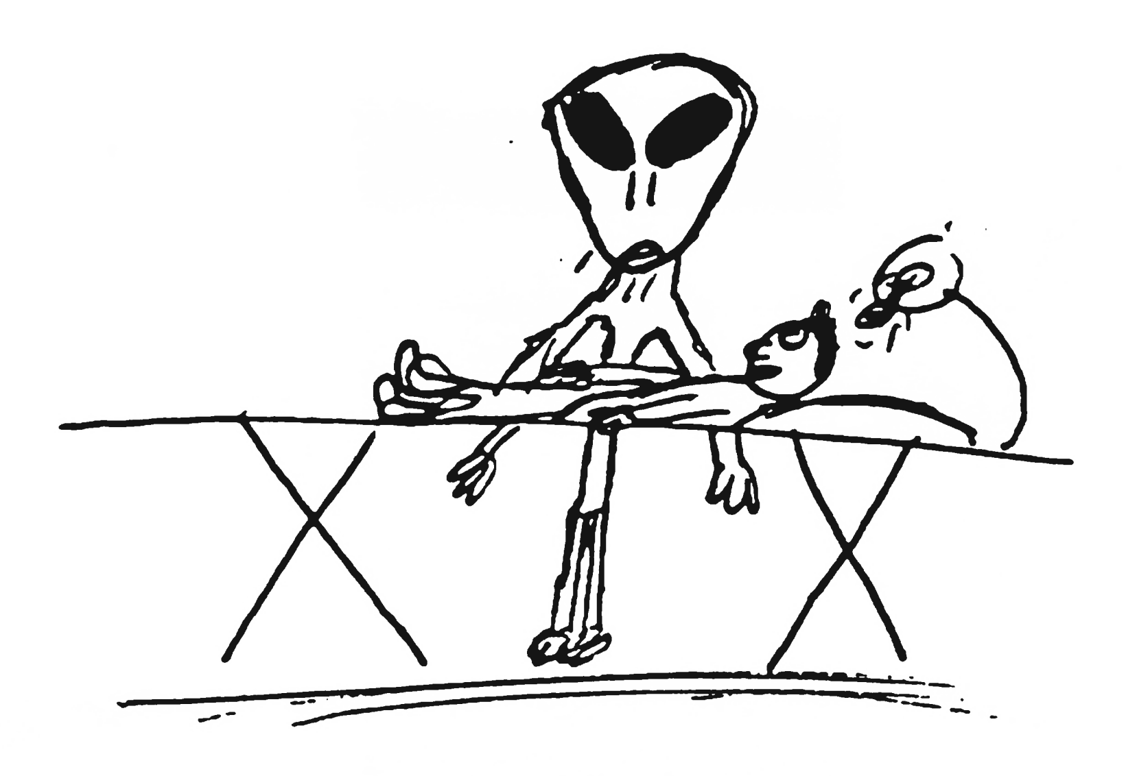
ON THE EXAMINATION TABLE