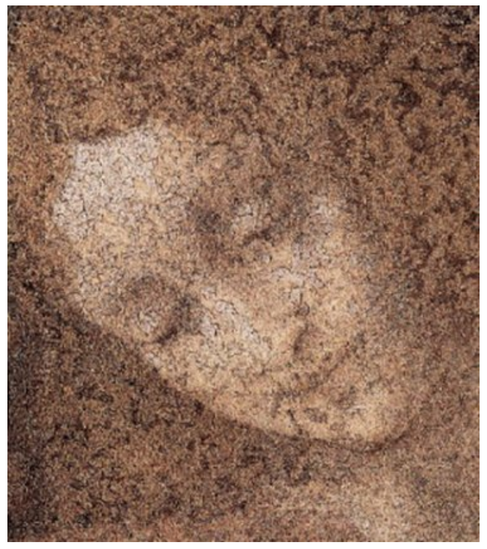
"John," taken from a detail of da Vinci's The Last Supper