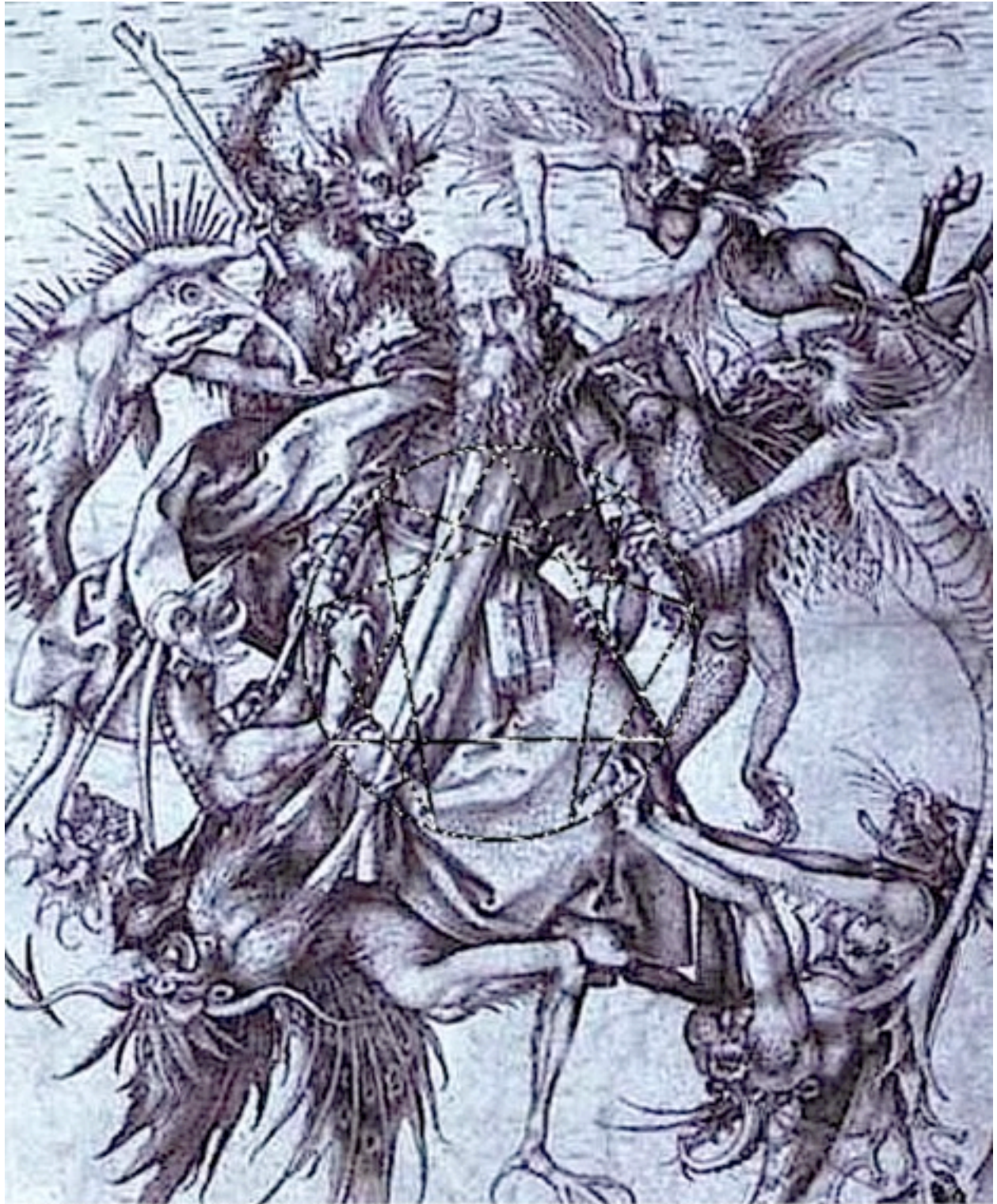
Each passion has its corresponding demon: Belphegor demon of sloth, Satan demon of anger, Lucifer demon of pride, Zagam demon of deceit, Leviathan demon of envy, Mammon demon of avarice, Agramon demon of fear, Beelzebub demon of gluttony, Asmodeus demon of lust.