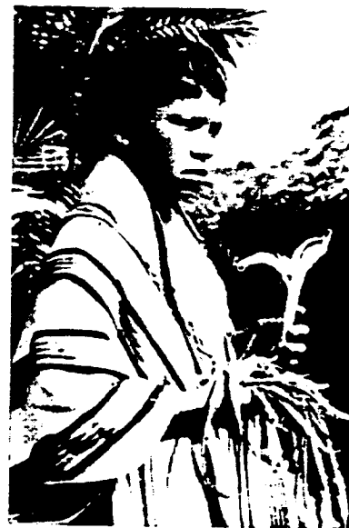
This young man is holding the most potent of the South American hallucinogens, known among the Kamsá Indians as culebra borrachera (Methysticodendron). He will drink a tea of this plant, material rich in scopolamine and other intoxicating alkaloids, to induce visions and to establish "learning spirit" with his teacher.

Each plant has its icaros, so that the repertoire of the shaman apprentice expands as he keeps adding other plants to the basic ayahuasca preparation ( Banisteriopsis caapi + Psychotria viridis ), or when he ingests other plant-teachers that are taken by themselves. The acquisition of magic chants or melodies and the memorization of myths during shamanic initiation seem to be a widely reported phenomenon. I have not yet made a systematic bibliographic survey, but it is possible that the association of the learning of magic chants or melodies with the absorption of the psychotropic plants is quite common. It is found among the Huichol, who ingest peyote ( Lophophora williamsii ) and other psychotropic plants, among the Mazatec,