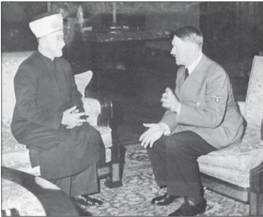
ABOVE: Emir Al Hussein, the Grand Mufti of Jerusalem and pro-Nazi agitator, with Adolf Hitler in Berlin.