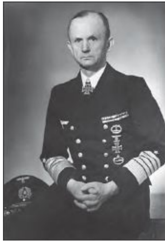
RIGHT: Admiral Karl Doenitz, former submarine commander during World War One who helped establish the Etappendienst network in Spain, and who later became Hitler's appointed successor as leader of the Reich.