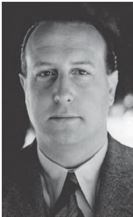
RIGHT: Walter Hewel, “Surabaya Wally,” Hitler's close friend and confidant from the days of the Beer Hall Putsch.