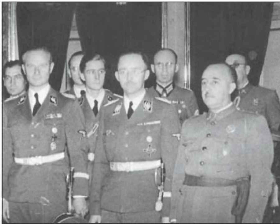
ABOVE: Heinrich Himmler with Franco in Spain.