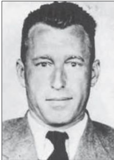
BELOW: Franz Stangl, Commandant of Treblinka. Escaped to Argentina.