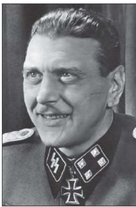
ABOVE LEFT: Otto Skorzeny, who would organize the Ratline in Spain with the help of Spanish dictator Federico Franco.