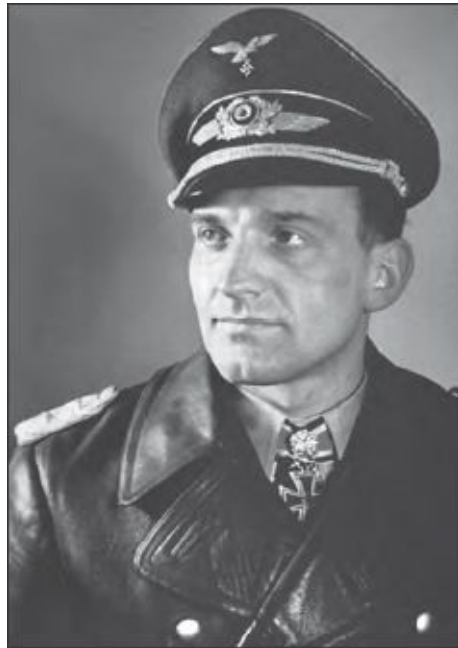
ABOVE RIGHT: Hans Ulrich Rudel, another key figure in the Ratline. Together with Skorzeny, he would remain in charge of Nazi financial support for escaping war criminals.