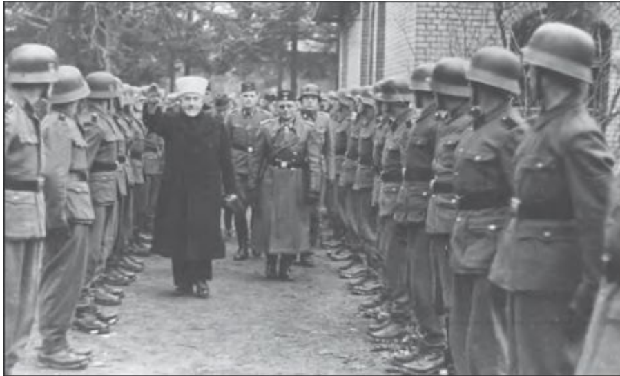
BELOW: Al Hussein inspecting the troops of the Muslim SS-Handschar Division, composed of Bosnian Muslim troops.