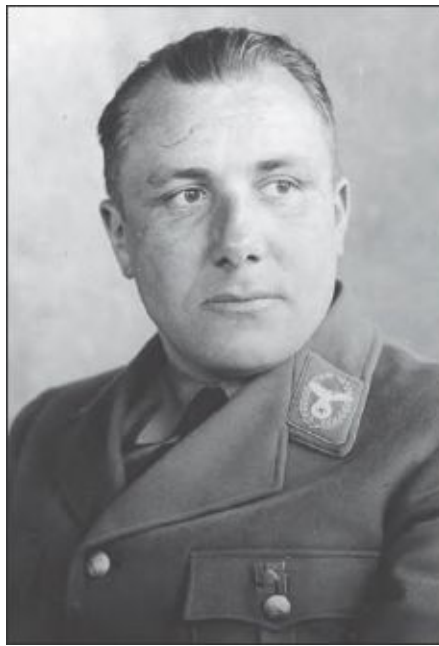
ABOVE: Martin Bormann, Hitler's second in command. Believed to have escaped to Paraguay.