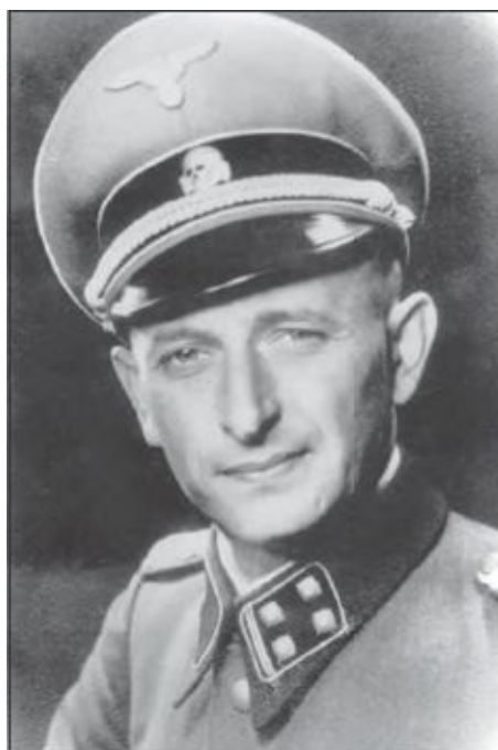
BELOW: Adolf Eichmann, Architect of the Final Solution. Escaped to Argentina.