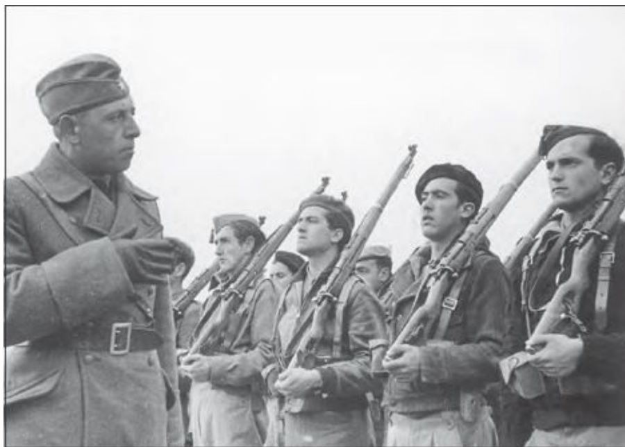
BELOW: The Condor Legion, Nazi troops in Spain to support Franco.