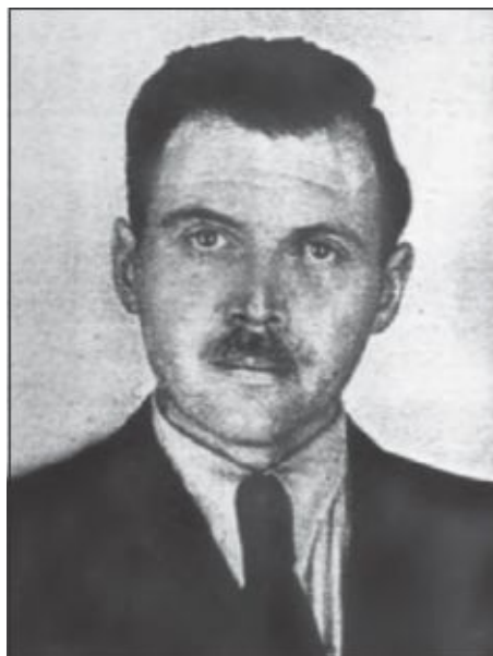
ABOVE: Josef Mengele, the Angel of Death of Auschwitz. Escaped to Brazil.