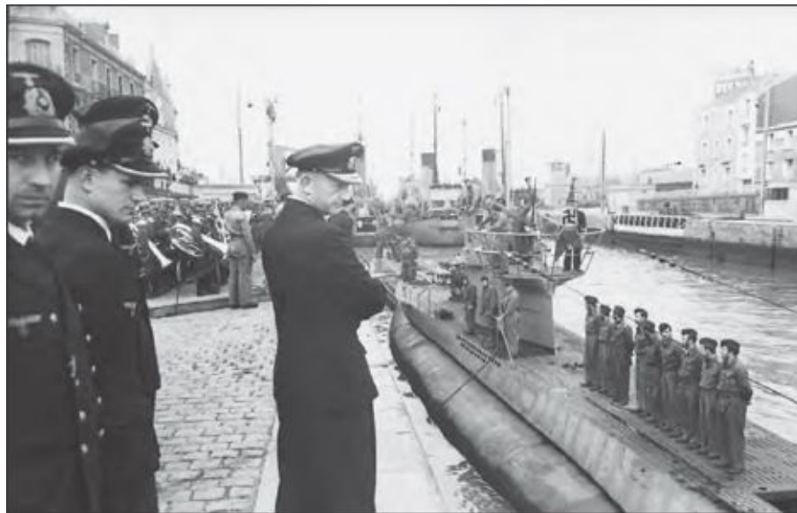
BELOW: Admiral Doenitz inspecting a U-Boat and crew in June of 1941. U-Boats would become essential elements of the Asian Ratline.