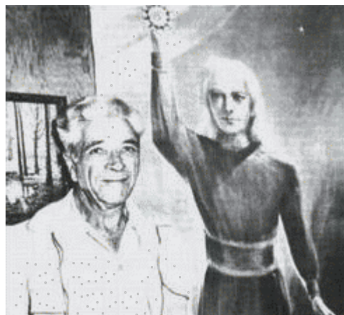
George Adamski, standing by a painting of one of his "contacts" from Venus

Significant in Adamski's description is how the two extraterrestrials could pass off as businessmen. Aside from a penetrating stare, nothing struck him as unusual in their appearance. Adamski goes on to explain how he went with them in their car to travel to a remote desert location: