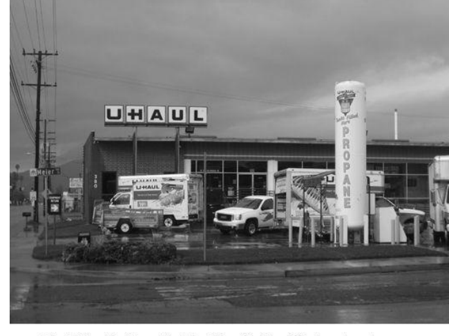
The U-Haul in Hemet that the Riverside Sheriff's department escorted me to.