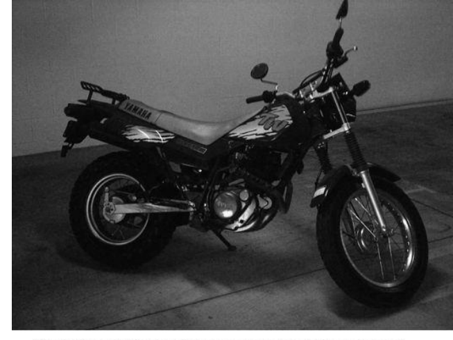
This is the motorbike I made my escape on and which was damaged when I was run off the road by Golden Era Productions security guards.