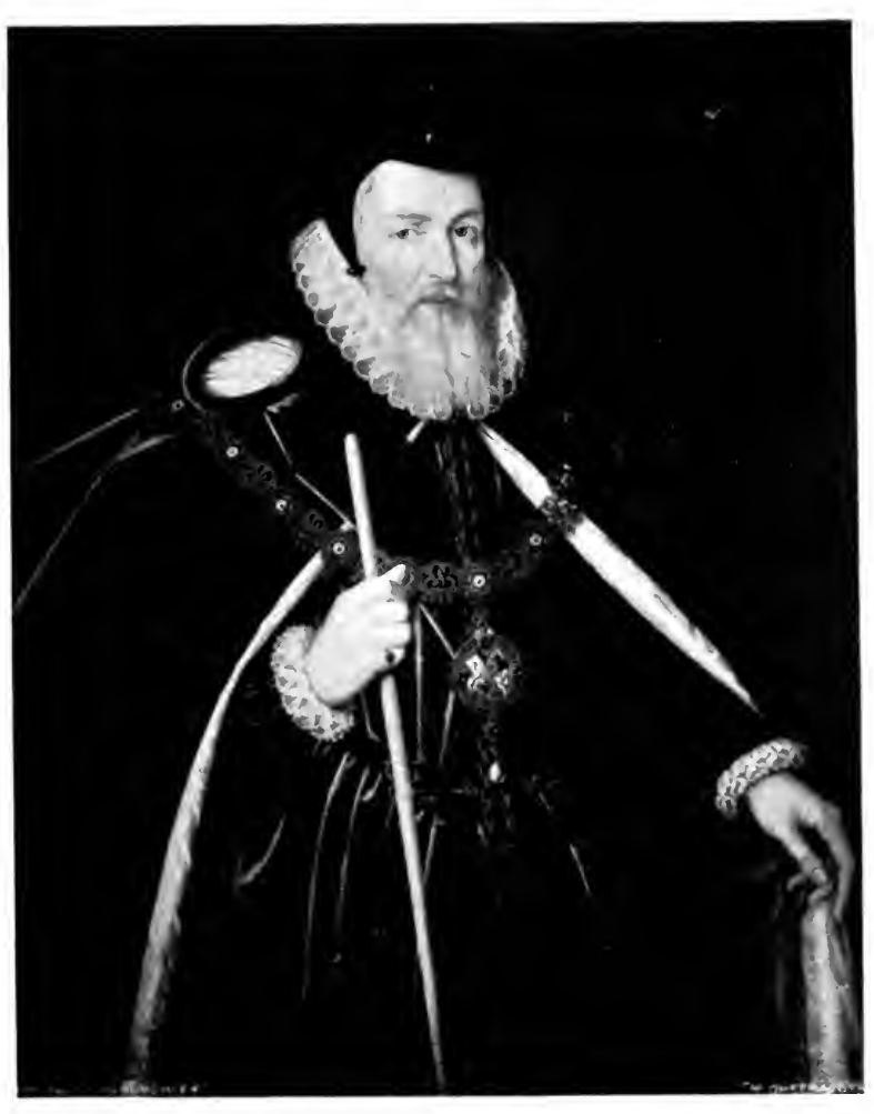
WILLIAM CECH, FIRST LORD BURGHEY, K.G., FROM THE PORTRAIT IN THE NATIONAL PORTRAIT GAMBERY, ATTRIBUTED TO M. GHERREDTS, FROM A PHOTOGRAPH BY EMERY WALKER, LIMITED.