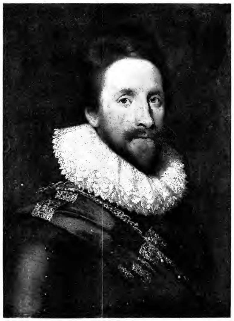
HENRY WRIOTHESIEY, THIRD EARL OF SOUTHAMPTON, FROM A PHOTOGRAPH FROM THE PORTRAIT FORMERLY IN THE POSSESSION OF THE LATE SIR JAMES KNOWLES