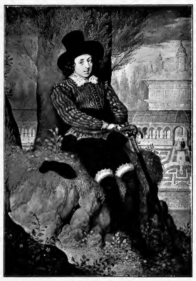
SIR PHILLIP SIDNEY, FROM THE MINIATURE BY ISAAC OLIVER AT WINDSOR CASTLE.