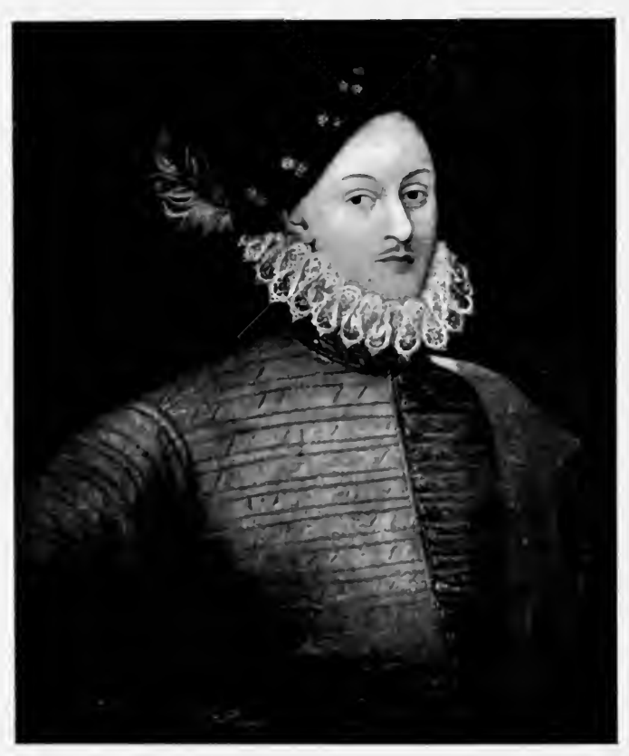
EDWARD DE VERE, SEVENTEENTII EARL OF ONFORD-AGE 25 FROM THE PORTRAIT AT WEIBECK ABBEY. REPRODUCED BY PERMISSION OF HIS GRACE THE DUKE OF PORTLAND.