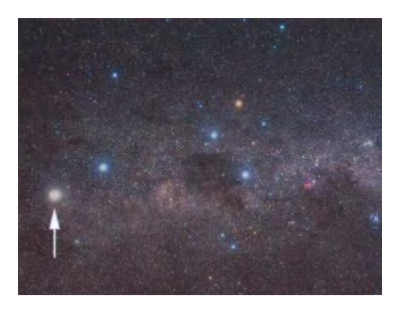
Alpha Centauri is the brightest star in the constellation Centaurus

Apparent Magnitude: 0.0 Absolute Magnitude: +4.3 Spectral Class: G2 Yellow Dwarf Optimum Visibility: May