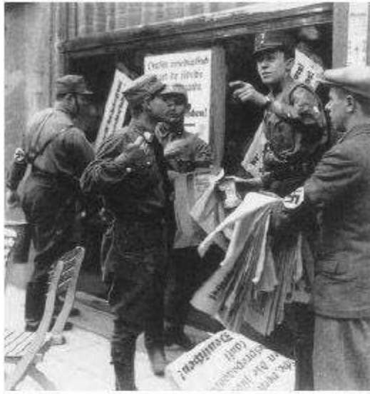
The April First anti-Jewish boycott