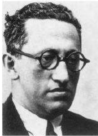
Chaim Arlosoroff