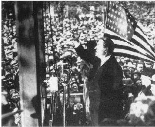
Stephen Wise addressing a protest rally at Battery Park, May 10, 1933.