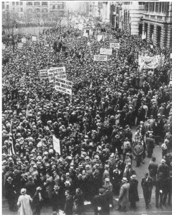
The May 10, 1933, protest sent a clear message to the Third Reich.