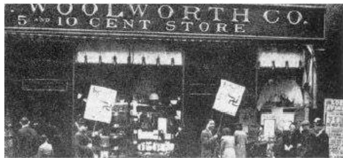
Jewish War Veterans picketing a store selling German goods.