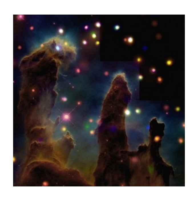
The Book of the Damned