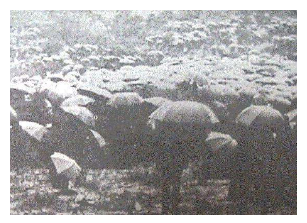
Above - Photo of the heavy rain storm that broke out upon the people who came to witness the miracle, 11:00 am, 13 Oct 1917

Witnesses also reported that their previously wet clothes became "suddenly and completely dry, as well as the wet and muddy ground that had been previously soaked because of the rain that had been falling.