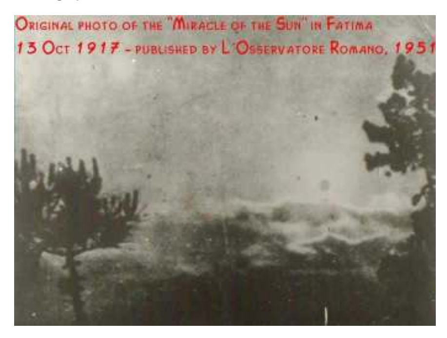
Appendix Photographs from "The Great Miracle of the Sun", 13 October 1917