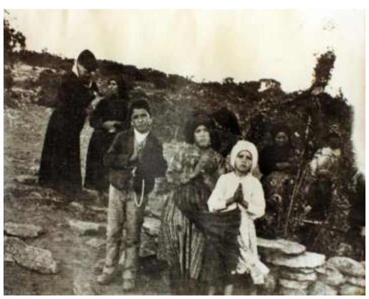
Above - The Three Children at the place of the Apparitions