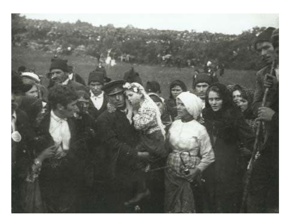
Above - Jacinta Marto is carried away following the "Miracle of the Sun"