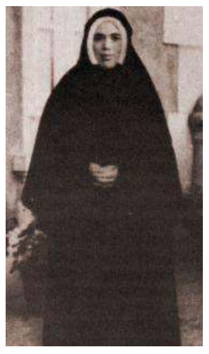
Above - Sister Lucia as a Dorothean Nun

In 1925 (18 yrs) Lucia joined The Sisters of St. Dorothy in Spain and in 1948 transferred to the cloistered convent of the Carmelites at Coimbra in Portugal, where Sister Lucia just disappeared from view.