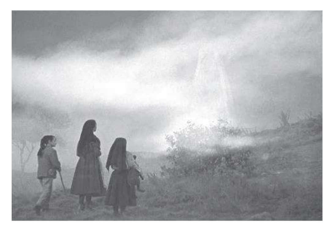
Above - An Artist's impression of the visitations at Fatima --()-- \,