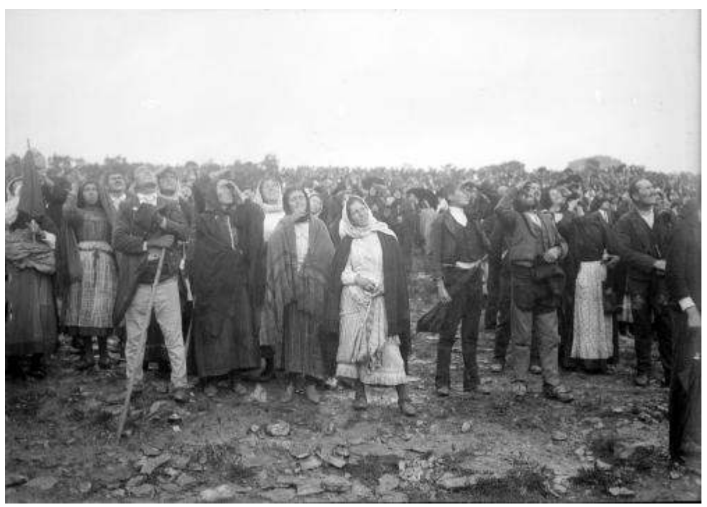
Above - Photo of people at the "Great Miracle", 13 Oct 1917

According to witness statements, after a down-pouring of rain, the dark clouds broke and the sun appeared as an opaque, spinning disc in the sky. It was said to be significantly duller than normal and