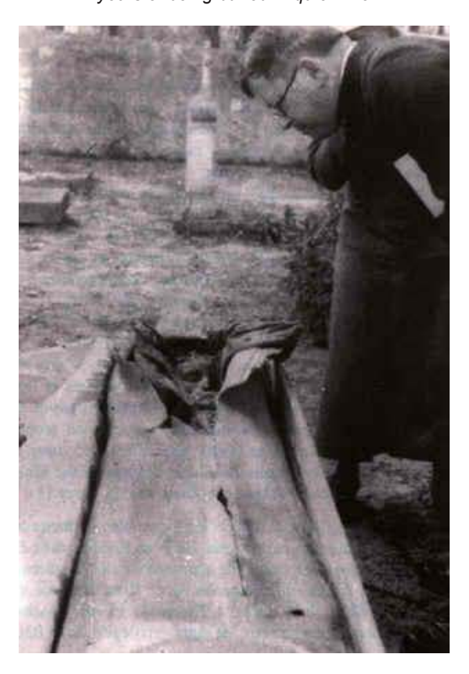
Above - Jacinta's Second Exhumation in 1951