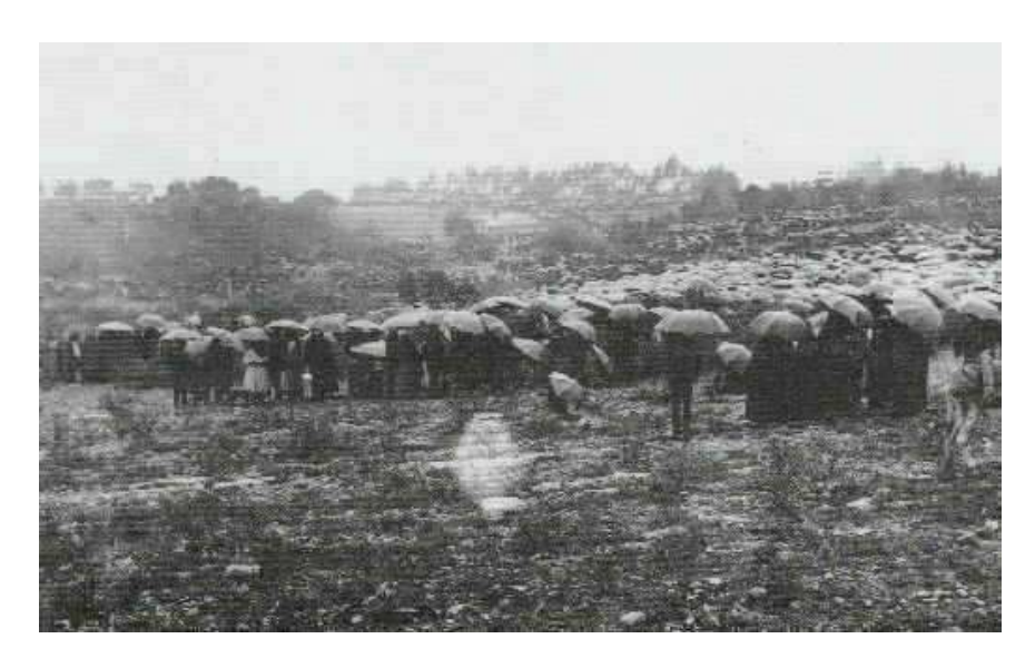
Above - The Downpour that Preceded the Miracle