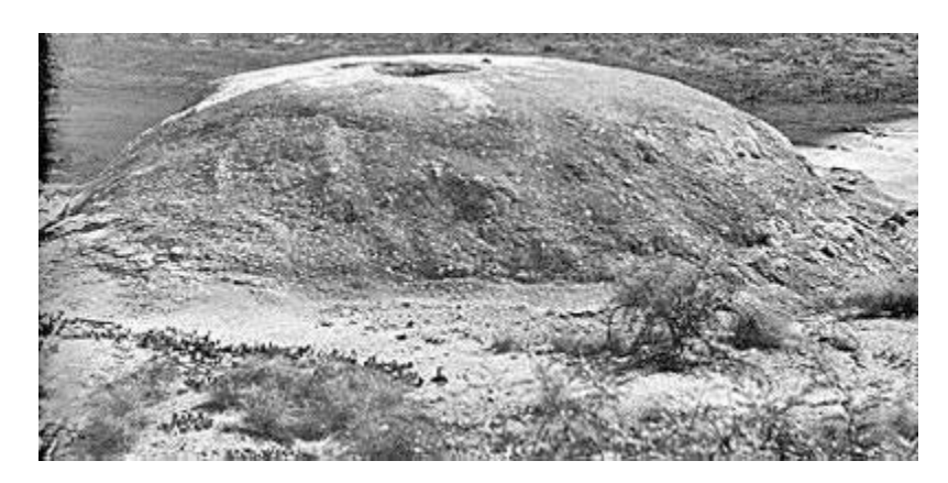
This spot is thought by some to be Sipapu, entrance to the Hopi Underworld. It is a sacred place of pilgrimage for the Hopi, at the bottom of the Canyon of the Little Colorado above its junction with the Colorado River.

Courlander describes the Hopi legend which states that the Hopi ancestors , before their 'emergence' to the surface world, migrated through different cavern regions until they came to the 'third' cavern world -- or the realm below the general ' Four Corners ' area of the Southwest, a series of caverns that were very extensive and in which crops were able to grow to some extent. Life there eventually became very oppressive for the majority of the Hopis when a few of their numbers turned to practicing sorcery, making it very difficult for the rest. The 'peaceful' Hopi 's later left this cavern world (in an attempt to escape the influence of the sorcerers who were collaborating with the advancing reptilian forces?) on a journey which took several days, leaving the sorcerers below. If true, this does not necessarily mean that all Hopi ancestors who remained below are presently collaborating with the reptilians .