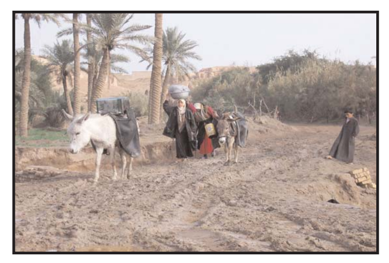
Women of village take donkeys loaded with water bladders to muddy water source.

increasingly defined by the pressures exerted by the scarcity of water. Bechtel was supposed to be part of a valiant American effort to alleviate the burden of water scarcity on the new and hopefully grateful subjects of U.S. power. In addition to the portions of Bechtel's contract which compel the company to improve water serv-