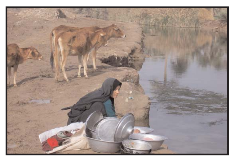
A woman washing clothes in a village water source near Najaf. Villagers report several children have drowned here while trying to collect water.

pump is all we have to try to pull some water to our home. So whenever we get some electricity we try to collect what water we can in this bowl."xxix He points to an empty metal bowl that sits near the lifeless pump.