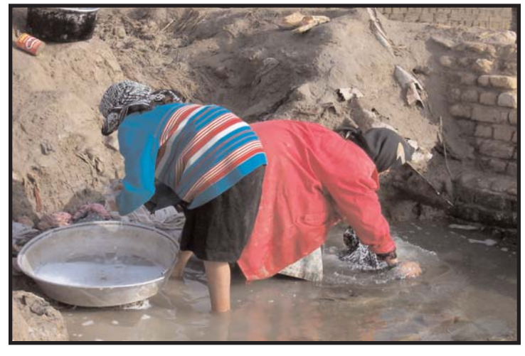
A mother and daughter washing clothes in a drinking water source for their village on the outskirts of Najaf.

Hilla, 60 miles south of Baghdad, has a water treatment plant and distribution center, which is specifically named in Bechtel's Assessment Report as one that they are responsible for rehabilitating in the short term to meet urgent needs for water. XiV It would also seem that Bechtel counts Hilla as one of 15 urban areas in which it should rehabilitate water infrastructure within six months (a time period which