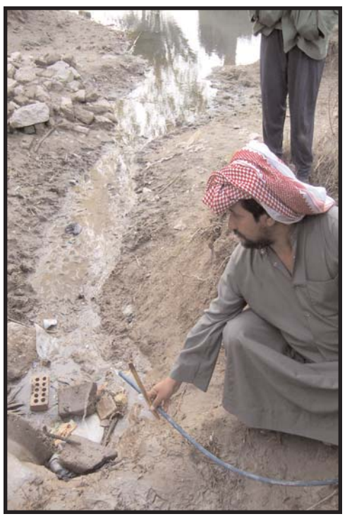
Village water source north of Hilla.

April 2004 © 2004 Public Citizen. All rights reserved This document can be viewed or downloaded www.wateractivist.org