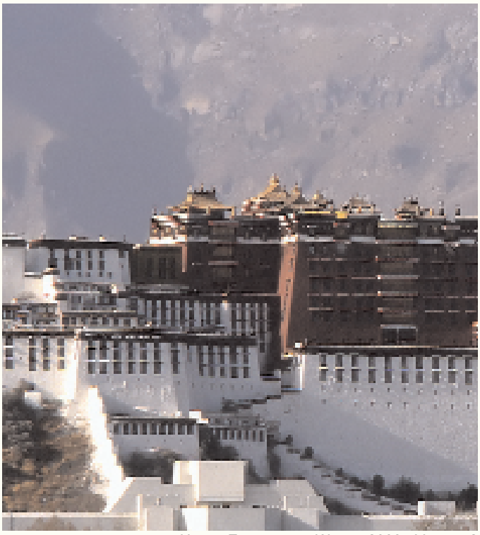
UnifiedEnergetics • Winter 2006 • Volume 2

Since the inception of the Complementary and Alternative (CAM) and Nutriceutical industries here in America, a lot of the direction in natural health, whether it is in the natural foods field or the alternative medicine field, has been towards industrialization. This is the path biomedicine has already taken, and given our longstanding healthcare crisis, it might not be a very good road for natural medicine to follow. Prior to this, the natural medicine movement in America had a strong populist grassroots character. It had, to a great degree, to do with expanding medical pluralism, and American's freedom to access alternative