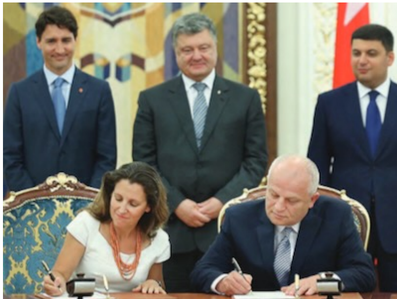
Chrystia Freeland and Stepan Kubiv sign the Canada-Ukraine Free Trade Agreement, in the presence of Prime Minister Justin Trudeau and President Petro Poroshenko.

In 2016, Liberal Prime Minister Justin Trudeau received with honors Mustafa Dzhemilev, whom his deputy Chrystia Freeland had already met. He had become, in August 2015, the emir of an international Muslim Brigade, co-financed by Ukraine and Turkey to retake Crimea [7].