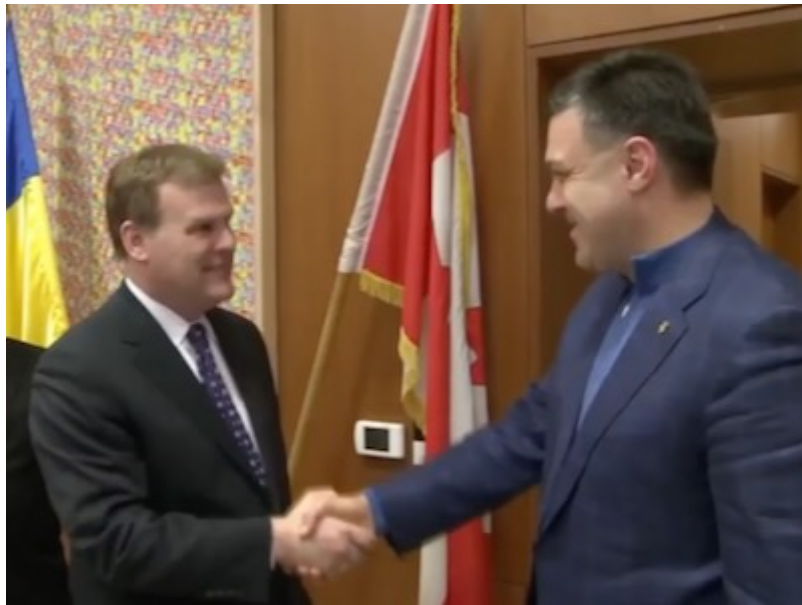
John Baird came to bring Canada's support to the leader of the neo-Nazi party Slovođa.

In 2014, Conservative Foreign Minister John Baird visited Maidan Square and met with the main leaders of the protest. Canadian Television considered that he was thus giving an argument to President Putin's version that this revolution is only a Western manipulation.