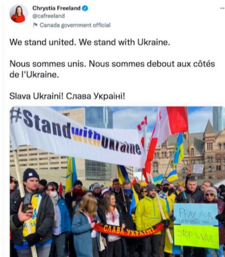
Chrystia Freeland demonstrating with the OUN(B) Banderites against Russian aggression in Ukraine. The small banner is in the black and red colors of the Banderites. It bears the slogan is of the Banderites "Glory to Ukraine!".

When in 2017, the site Russia Insider revealed the criminal past of her grandfather and his still close ties with the Banderites, she denied the facts and denounced Russian "propaganda". However, on February 27, she appeared with a group of OUN(B) Banderites at a demonstration against Russian aggression. The photo, which she posted herself, was quickly removed from her Twitter account.