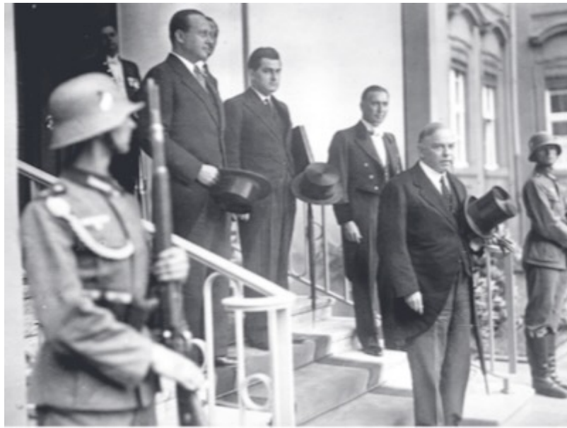
Canadian Prime Minister William Lyon Mackenzie King after his meeting with Führer Adolf Hitler in Berlin (June 29th, 1937).

While the CIA's connections to the Nazis during the Cold War were not revealed until 1975 with the Pike, Church and Rockefeller Congressional Commissions, and only ended with President Jimmy Carter, the Canadian Liberal Party's ties to the Nazis continue. Canada is the only country in the world, outside of the Ukraine, to have a Banderite minister, and what's more, she is the number two in its government.