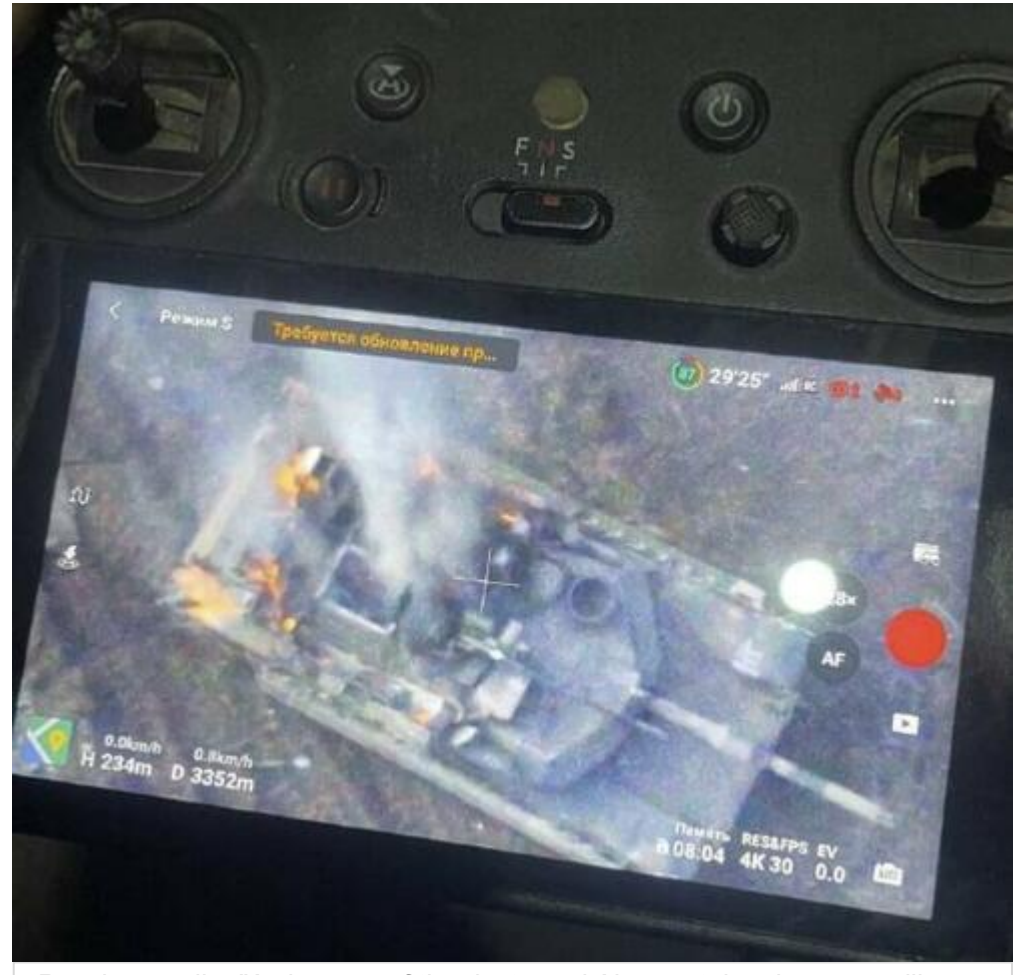
Russian media: "A close-up of the destroyed Abrams taken by a surveillance drone shows the vehicle's ammunition compartment burned-out."

The US-made advanced tank was reportedly taken out by a kamikaze drone or loitering munition launched by Russia's 15th Motorized Rifle Brigade. Russian state media accounts made the announcement Monday and published video purporting to show the destruction of the M1 Abrams main battle tank.