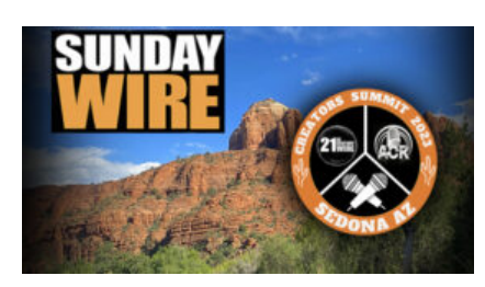
EPISODE #479 – LIVE FROM SEDON WITH GUESTS

2020 Election, 2024 Election, Featured, lawfare, Trump, US News