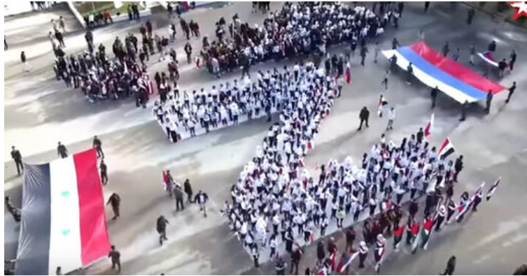
Rallies taking place in support of Russia in Syria

You could say that this is how Putin's Russia naturally acts and builds relationships. To help out those in need and countries that ask for it. Syrian president Bashar al-Assad had the following to say about this: If Moscow asks, Syrians will fight with Russia in Ukraine.