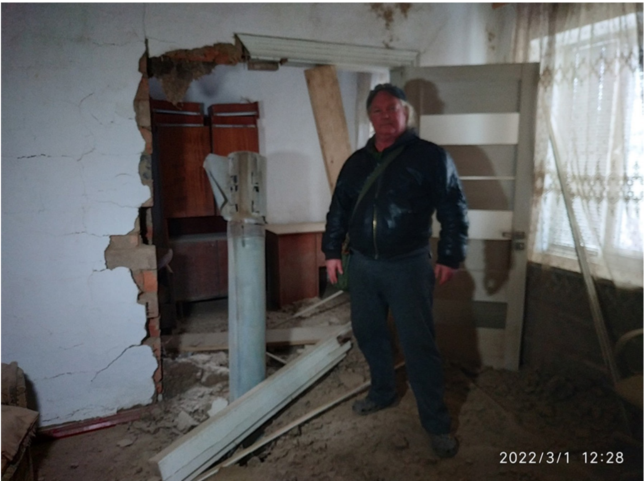
(Unexploded GRAD missile inside civilian house in the village of Andon)

I spent Feb 28th and March 1st on the Front lines deep into territory formerly controlled by ukrop army. Traveling with Russian war correspondent Alexander Sladkov, we made it as far as the village of Andon, almost 50 Km beyond the former front lines. Fighting is heavy, we saw many blown up ukrop block posts, and armored vehicles from both sides, but mostly ukrop. It was like something out of a World War 2 newsreel, with shell shocked civilians gathered in town squares, wary of us as we approached, then breaking into tears of joy when they understood who we were. Ukrops are randomly bombing the areas they retreat from as they retreat, apparently equally as willing to hit newly liberated civilians as they are to hit the Russian liberators.