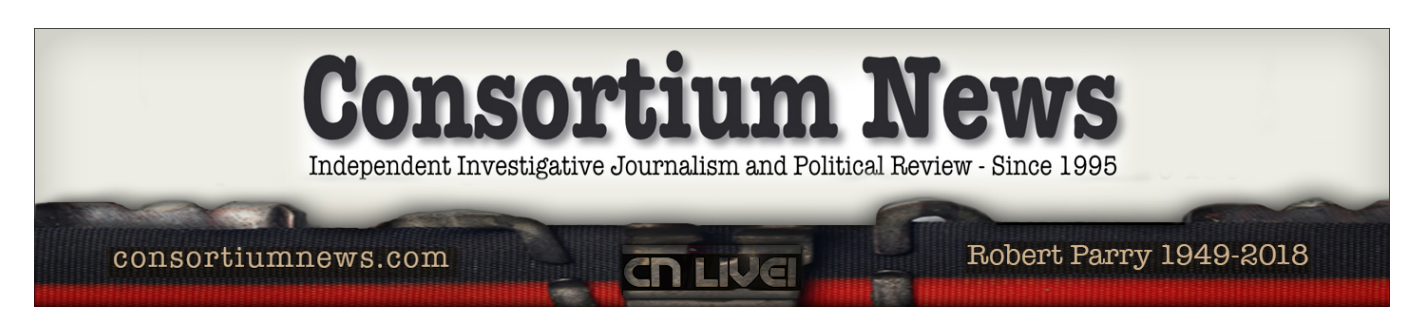
Volume 27, Number 63 – Friday, March 4, 2022

AMERICAN EMPIRE, ANALYSIS, COMMENTARY, MEDIA, RUSSIA, UKRAINE