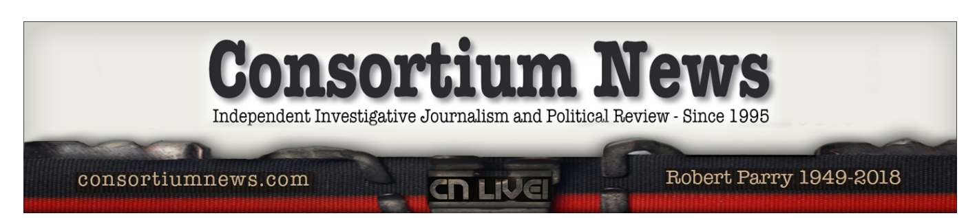
Volume 27, Number 63 – Friday, March 4, 2022