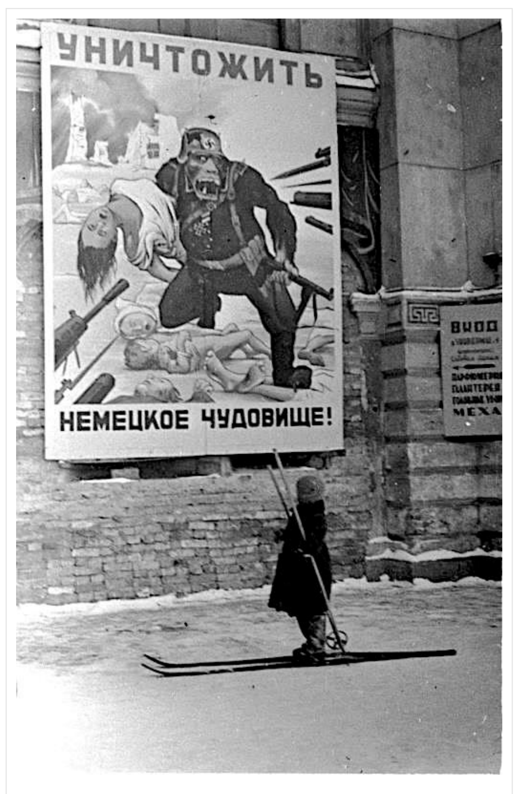
Lviv (west Ukraine) during WWII. Inscription on Soviet poster says: Destroy German Monster.

First, in Crimea and then in the so-called Donbas region,