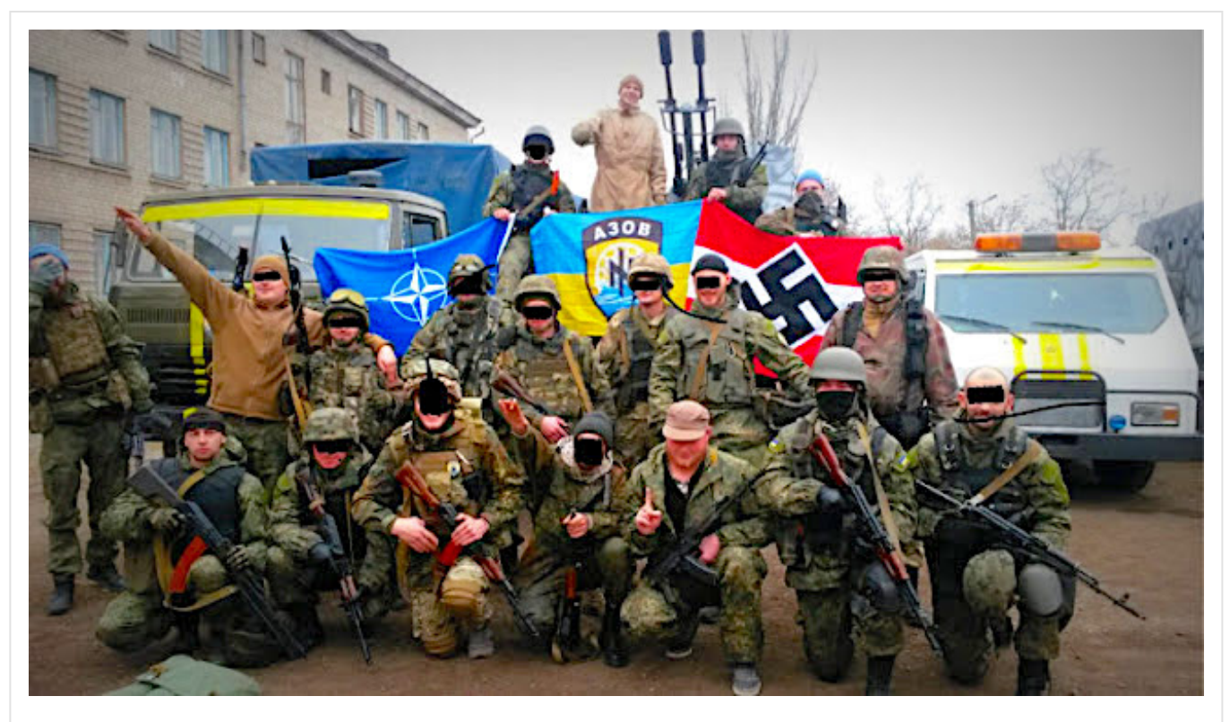
Azov Battalion members.

So, for nearly a year and a half, the West's mainstream media, especially The New York Times and The Washington Post , twisted their reporting into all kinds of contortions to avoid telling their readers that the new regime in Kiev was permeated by and dependent on neo-Nazi fighters and Ukrainian ultranationalists who wanted a pure-blood Ukraine, without ethnic Russians.