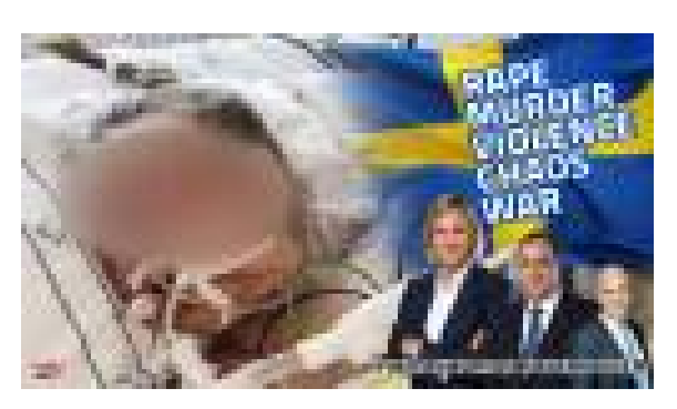
Jul 17, 2022

Let's Check In On Sweden, The "Humanitarian Superpower"