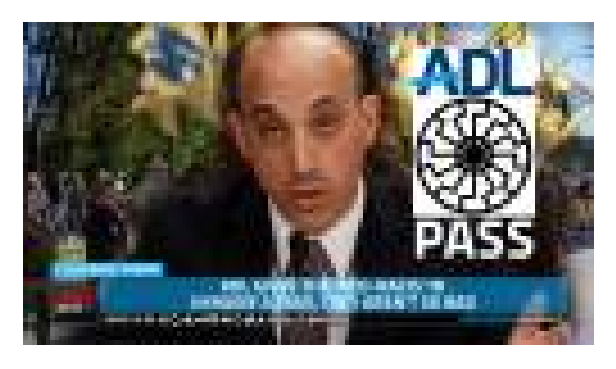
Gay/Trans/Bi/LGBTQIA2S Hysteria Over... Apr 03. 2022

ADL Gives the 'Neo-Nazis' In Ukraine A Pass,... Mar 29, 2022