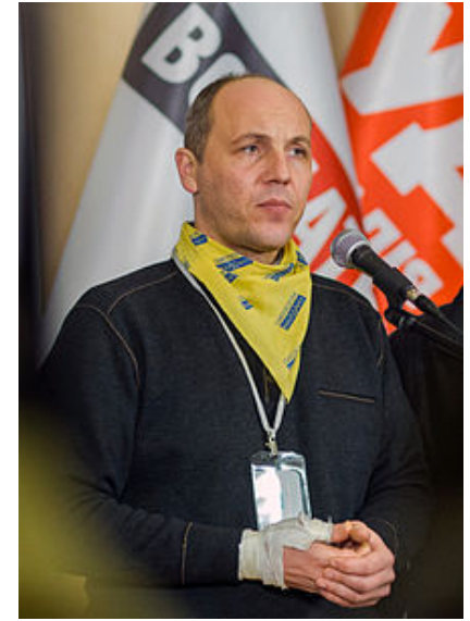
Ukrainian Secretary for National Security Andriy Parubiy.

“Ukraine’s interior minister, Arsen Avakov, wrote on Facebook that about 60 pro-Russian militants had tried to seize the city’s police headquarters. The police called for support from the Ukrainian national guard, a newly formed force of quickly trained volunteers drawn from participants in last winter’s street protests in the capital. Mr. Avakov wrote that 20 ‘terrorists’ had died in the fighting, while those who survived dispersed and hid in a residential neighborhood.”