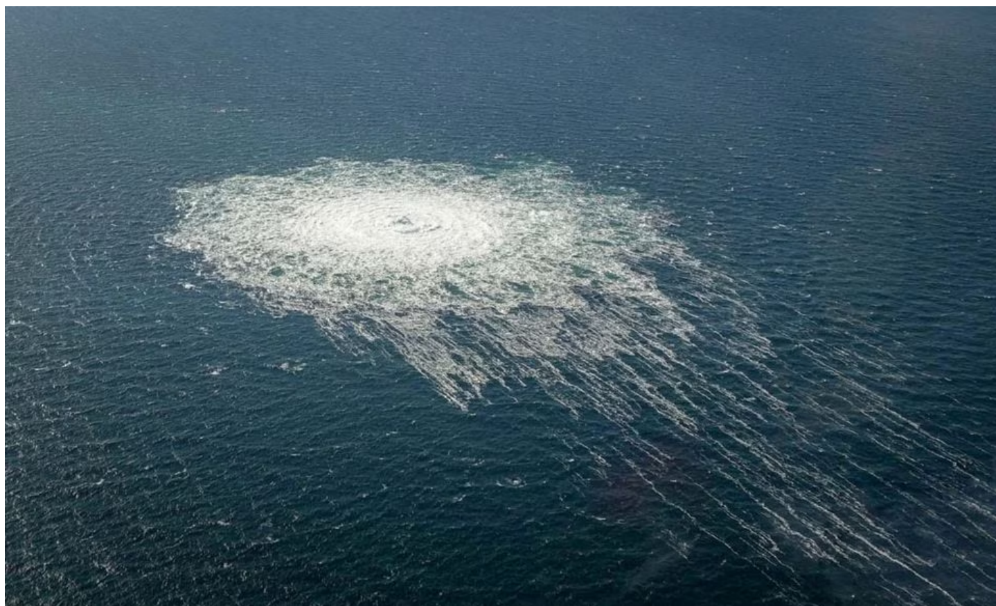
Gas bubbles from the Nord Stream 2 leak reaching surface of the Baltic Sea in the area shows disturbance of well over one kilometre diameter near Bornholm, Denmark, September 27, 2022.

By Guy Faulconbridge and Vladimir Soldatkin