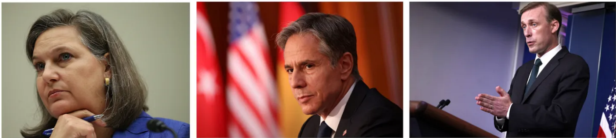
THE PLAYERS Left to right: Victoria Nuland, Anthony Blinken, and Jake Sullivan.

What became clear to participants, according to the source with direct knowledge of the process, is that Sullivan intended for the group to come up with a plan for the destruction of the two Nord Stream pipelines—and that he was delivering on the desires of the President.