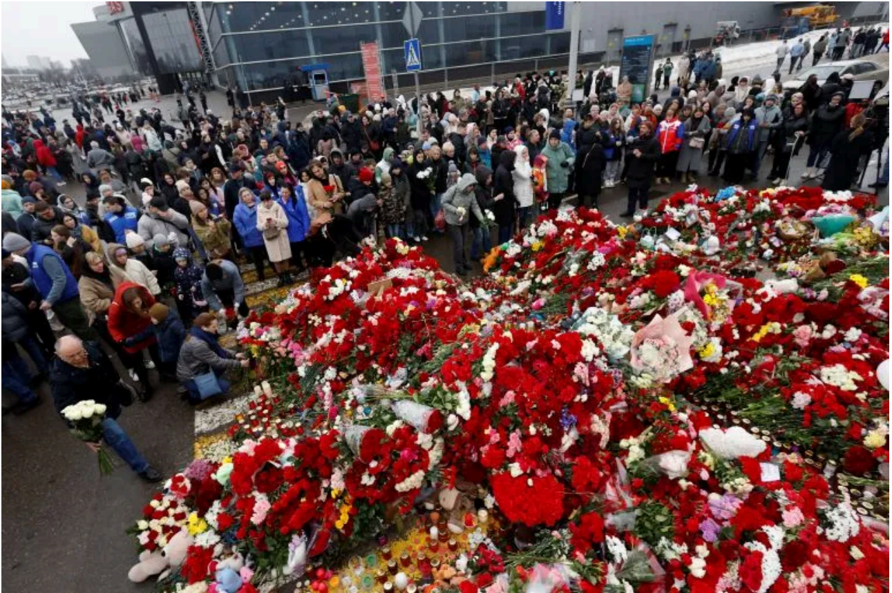
People gather at a makeshift memorial for the victims of a shooting attack set up outside the Crocus City Hall concert venue

It was quite instructive how quickly the client media in the West assigned at the behest of their government masters, blame to ISIS. Operation Timber Sycamore, the brainchild of the CIA in 2013, painted a facade of liberty while orchestrating a theatre of chaos and constant tension. Under the pathetic guise of nurturing democracy in Syria, the CIA, with MI6 and Mossad et. al, engaged in a calculated charade, peddling "moderate rebels" as a smokescreen and middleman for their real agenda. This not-so elaborate ruse was not just about arming purported freedom fighters; it was an orchestrated pipeline funneling lethal aid and vast sums of black budget money to the very epicenters of radicalism. ISIS and Al-Nusra, draped in the banners of Wahhabi extremism, were not mere byproducts of conflict but the beneficiaries of a coldly calculated Western strategy that saw their barbarism as a necessary evil in the pursuit of hegemonic dominance.