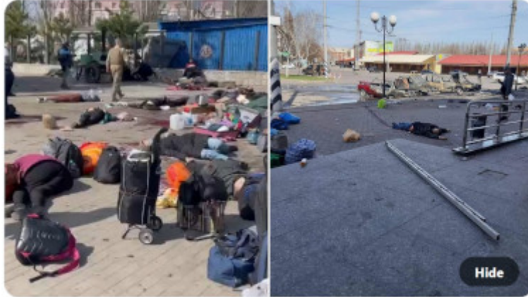
11:02 AM · Apr 8, 2022 · Twitter Web App

Reports from Kramatorsk indicate that a Russian ballistic missile carrying cluster munitions hit the train station, killing more than 30 people. Strikes using ballistic missiles are weighed carefully & it's clear that this strike was a premeditated attack on evacuating civilians.