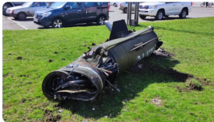
11:15 AM · Apr 8, 2022 · Twitter Web App

The side of the Russian missile that killed 30+ civilians in Kramatorsk says "for the children" in Russian, implying that Russia is avenging the killing of children. Hard to imagine a more fitting symbol for Putin's war.