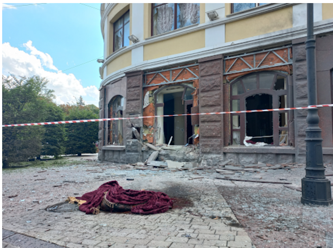
Ukraine's bombing of central Donetsk on August 4 targeted a hotel the author was in, killing a woman outside and five others nearby.

This is something I witnessed for myself when, on August 4, Ukraine bombed the hotel in which I was staying, the fourth and fifth shells landing 50 meters away and then directly beside the hotel, respectively. When the fifth struck, shattering inwards the lobby glass doors, I had fortunately just stepped out of the lobby where 30 seconds earlier I had been speaking to journalists who had run in from the street.