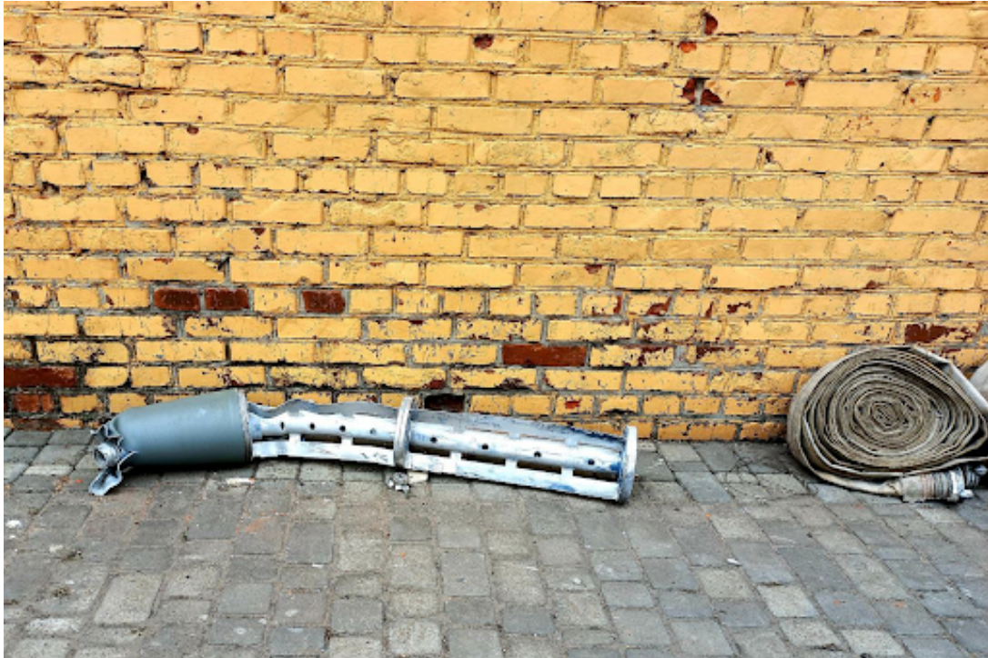
Remnants of a Ukrainian-fired "Hurricane" MLRS missile on the grounds of a Donetsk Emergency Services station in a civilian area.

Local residents describe the perpetrators of these crimes—who have received lavish U.S. funding—as “shameless,” “scumbags” and “terrorists.”