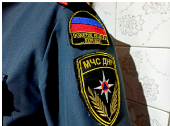
Donetsk Emergency Services crest.