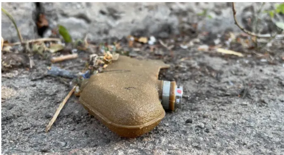
Petal mine on street in Donetsk.

In Makeevka, just east of Donetsk, I went to an orphanage that had been shelled with the mines. Most of the clean-up was completed by the time I arrived on the second day of de-mining, but one remained. I watched a sapper find and detonate it, and although I had previously seen a group of eight mines detonated, creating a massive blast, the force of the single mine was still quite powerful.