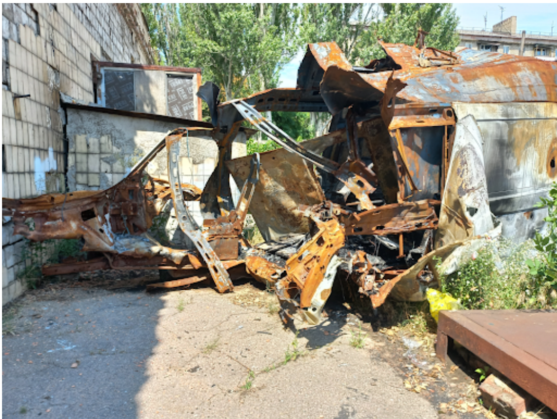
Donetsk ambulance destroyed by Ukrainian shelling while out on a call.

In early June, heavy Ukrainian shelling of Kuibyshevsky District, Donetsk, destroyed an ambulance and seriously injured the driver.