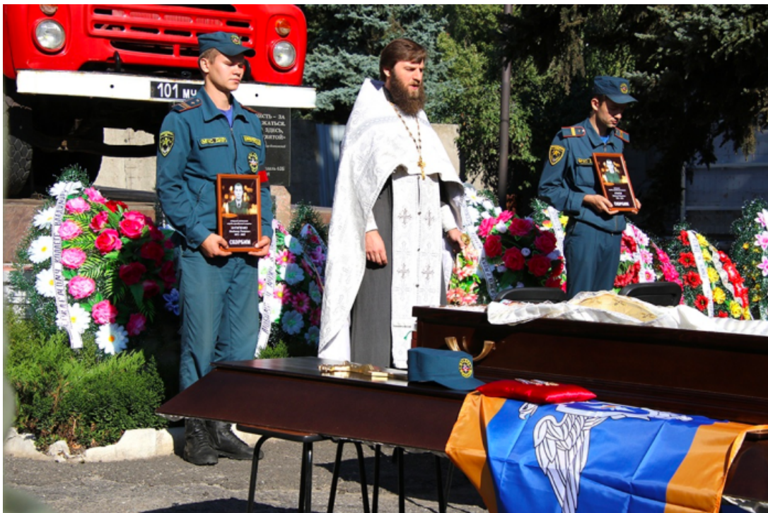
A funeral ceremony of farewell to two dead employees of the 14th fire and rescue unit of the Ministry of Emergency Situations of the DPR was held in Makeevka”

With Ukraine’s targeting of Emergency Services in September, the number of rescuers Ukraine has killed is now at least 19, with another 51 injured.