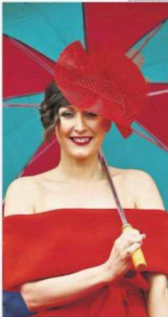
Winslet in red A ragswain yesterday at Ascot, where three women will compete in the Grand National's Turf. Kate Winslet is better known on Blue Sky Day. Pages 13-15, subject