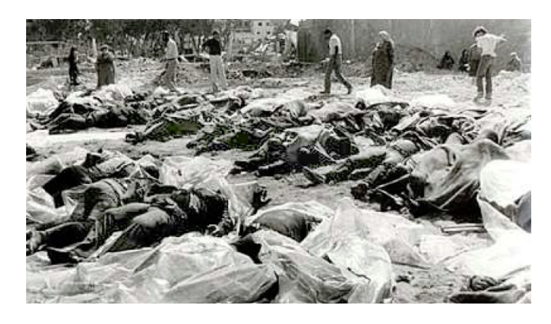
(<u>https://infrakshun.wordpress.com/wp-content/uploads/2014/04/deir-yasin.jpg)</u>Deir Yassin massacre April 9th 1948

In the 1960s the true agenda was beginning to reach the press. David Ben Gurion's special adviser on Arab Affaigs expressed his desire to: "... reduce the Arab population to a community of woodcutters and waiters, and by the 1970s, when an Israeli government memorandum entitled "The Koenig report" was leaked by Israeli newspaper Al-Hamishmar it laid bare the policy of systemic expulsion of Palestinian people though somewhat euphemistically expressed. Regarding the Palestinian minority the only thing needed was the: "...objective thought that ensures the long-term Jewish national interests"... while [20] stressing the examination of "... the possibility of diluting existing Arab population concentrations."