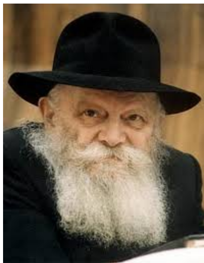
Rabbi Menachem Mendel Schneerson

Despite this, his statements are mild compared to what we would find in classical Jewish doctrine of the Talmud, the Tanya and a succession of Grand Rebbes’ proclamations. It seems he also forgot the legacy of Schneerson. Though he paid lip service to “compassion” it was clearly the words rather than the basic premise that gave rise to the invective which was “irresponsible” and “misleading.” Another fine example of paralogical and paramoralistic discourse at work. Like the banking, oil and weapons and hedge fund billionaires of today, philanthropy conceals a multitude of sins. With the Establishment hierarchy it is a conscious means to an end which has little to do with alleviating humanity’s suffering rather, philanthropy offers a way to keep the illusion of altruism in place and to buffer the disconnect between what they say and what they do. Organised Religion, with its cults and sects are no different. The hierarchical structure comes first regardless of whether the moral and ethical pillars have long since been eaten away by parasites. The vast majority of responses from presumably Jewish readers condemned the Rabbi’s views in the strongest possible terms. Though there were scattered posts praising or excusing what are essentially statements celebrating a cold-blooded religious psychopathy.