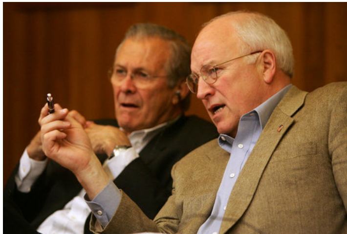
Paul Wolfowitz at a Friends of Israel meeting 2009

( https://infrakshun.wordpress.com/wp-content/uploads/2015/04/20060613_v061306db-0178jpg-515h.jpg ).