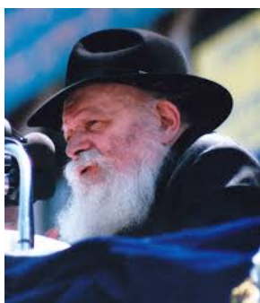
Rabbi Menachem Mendel Schneerson

Thus, we do not have a case of profound change in which a person is merely on a superior level.