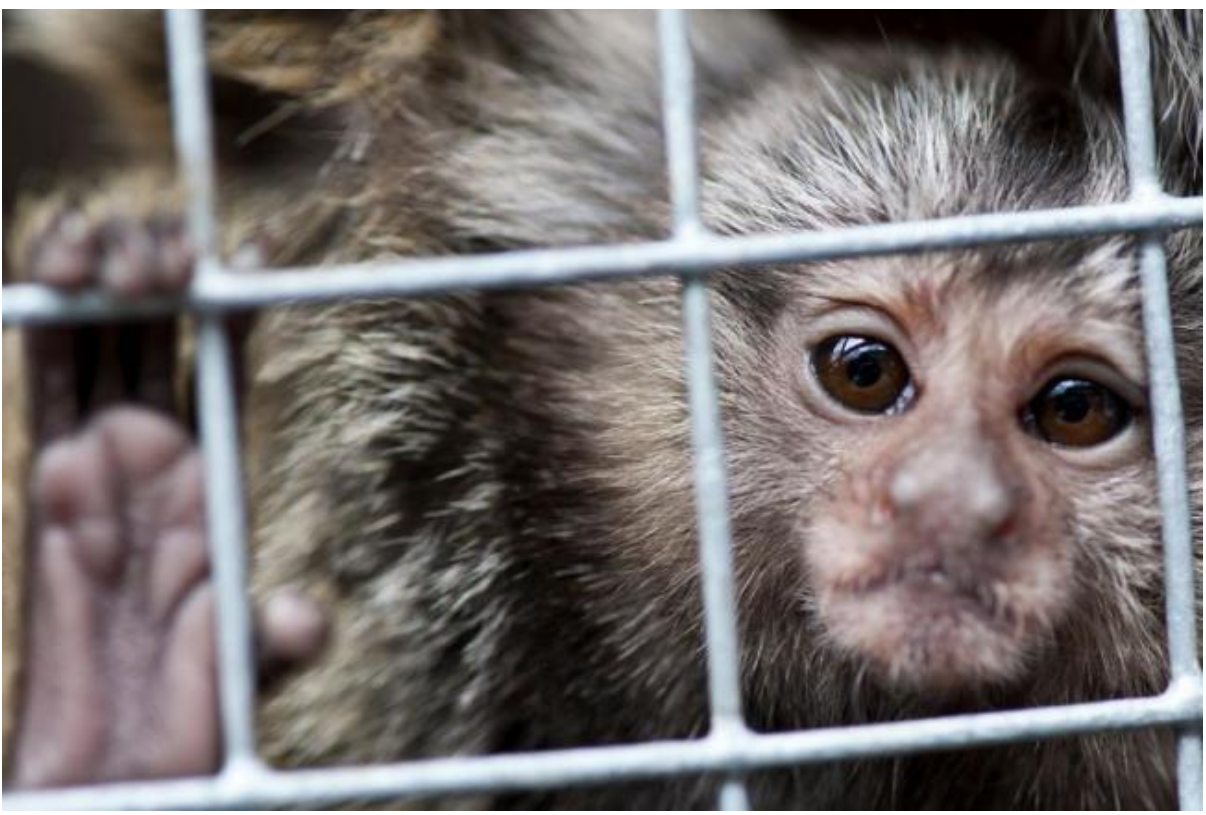
Marmoset monkeys are experimentally infected at Porton Down with Ebola, Anthrax, Marburg Virus and other deadly pathogens. Scientists measure time to death and lethal dose of exposure to the bio agent.