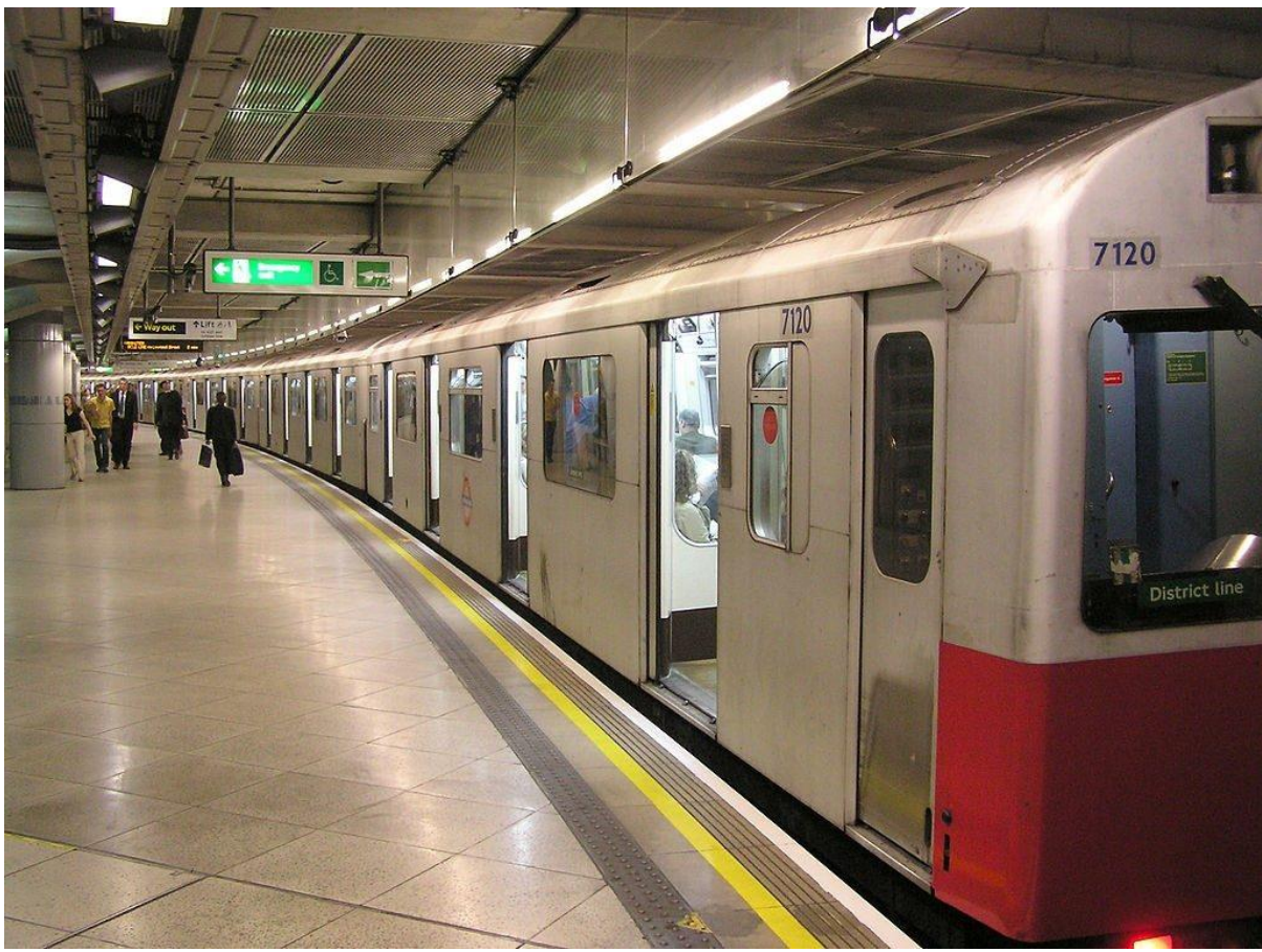
Porton Down scientists released chemical gas on the London Underground in 2013.

Chemical gas was released on thousands of unsuspecting commuters during a military experiment on the London Underground, documents reveal. These chemical tests were performed in 2013 by scientist from Porton Down.