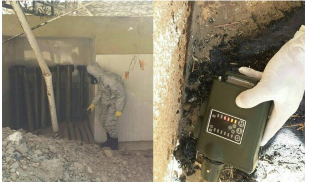
Iraqi soldiers captured <u>a cache of chemical weapons from ISIS in Qayarah, Iraq</u>, the rockets tested positive for sulfur mustard, October 2016.

According to information obtained from the US Federal contracts registry, Porton Down scientists 5 months ago completed a $ 2 million military program involving chemical gas experiments on animals. This program was funded by the US Department of the Army on behalf of the U.S. Army Medical Research Institute of Chemical Defense (USAMRICD) and was <a href="Launched in 2008">Launched in 2008</a> and further <a href="extended in 2012">extended in 2012</a>. The work on the program included Phosgene Gas tests. Amongst them — <a href="Continued Model Development to Establish Reproducible Phosgene Injury at 24 Hours">extended in 2012</a>. According to the program documents, the purpose was to monitor the development of acute lung injury following phosgene exposure. Phosgene gas was used extensively as a chemical weapon, most notably during World War I.