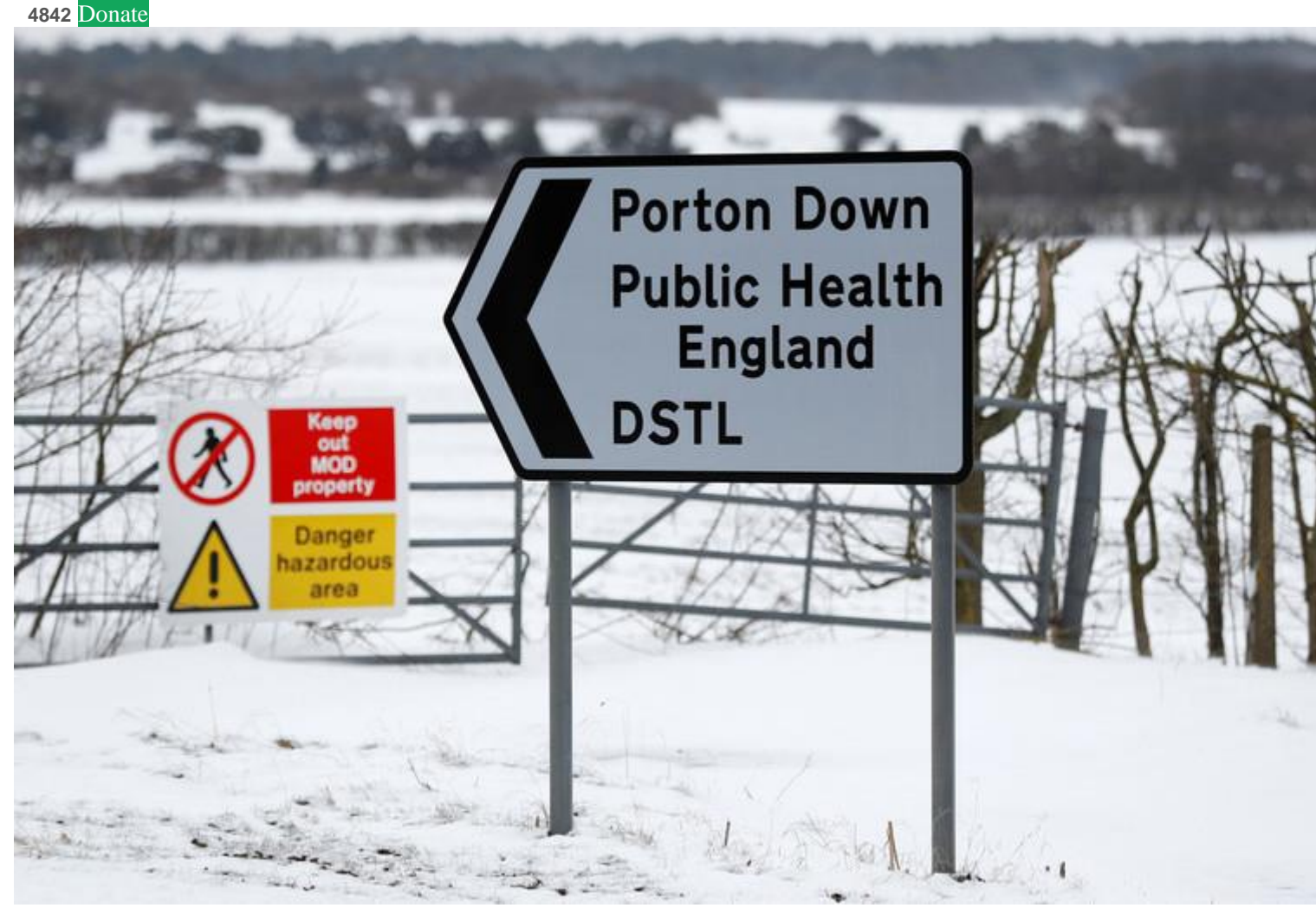
Signs prohibiting access near to the Porton Down Defence Science and Technology Laboratory, near Salisbury, Britain, March 19, 2018.

https://southfront.org/salisbury-nerve-agent-attack-reveals-70-million-pentagon-program-porton