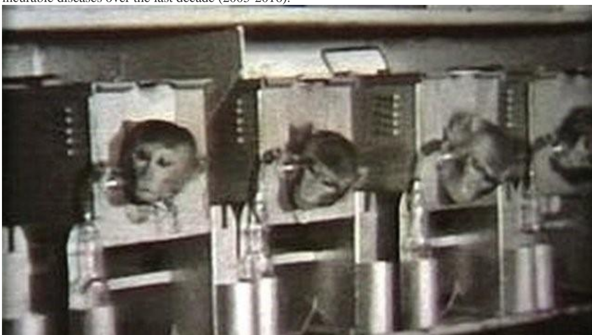
Monkeys being used in warfare agent testing at Porton Down in the past Animals used include mice, guinea pigs, rats, pigs, ferrets, sheep, and non-human primates. Some of the deadly experiments have been sponsored by the Pentagon under contracts between DSTL and DTRA. Scientists at Porton Down have infected, or poisoned, animals in order to measure time to death and lethal dose of exposure. In practice, the possible use of the researched virus/chemical gas as a weapon.

<u>Data obtained via the Freedom of Information Act</u> though gives an idea of the dimensions of military <u>chemical and biological</u> <u>experiments</u> carried out at Porton Down. A total of <u>122,050 animals</u> have been exposed to deadly pathogens, chemicals and incurable diseases over the last decade (2005-2016).