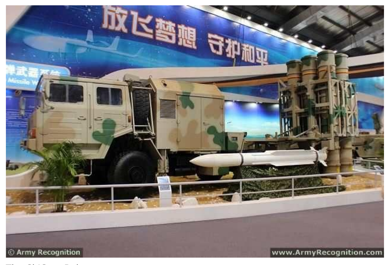
The ChiCom Buk

It really is time, with respect, that MPs and journalists started to grapple with the facts, rather than ventilating absurd and offensive conspiracy theories involving Russia. The problem is that so many MPs and journalists are intelligence-illiterate. Most of them have never even heard of GO2 or the DVD.