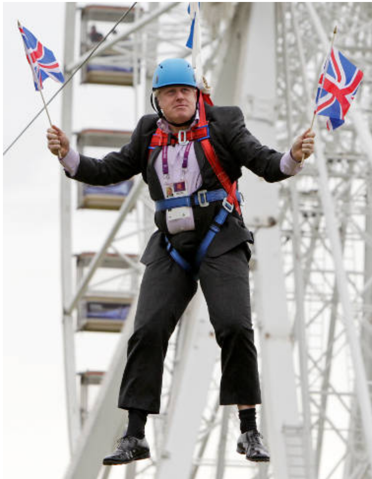
British Foreign Secretary Boris Johnson - bigger

"We actually have evidence within the last 10 years that Russia has not only been investigating the delivery of nerve agents for the purposes of assassination, but has also been creating and stockpiling Novichok," Johnson told the BBC.