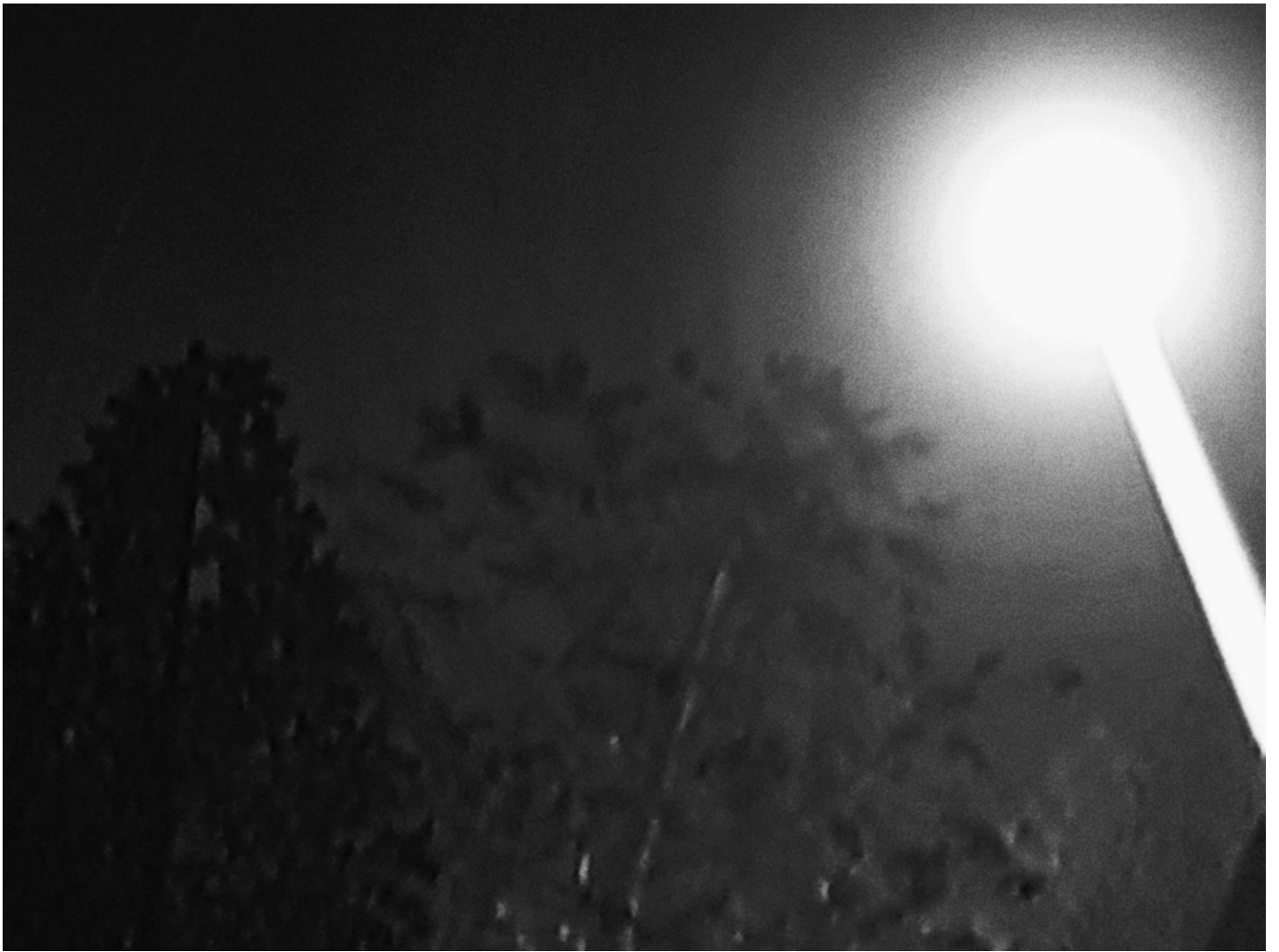
One of them appears to show a beam of light shooting out of a giant orb