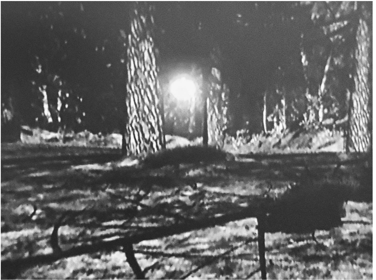
The photos appear to show the orb floating through the sky over the trees