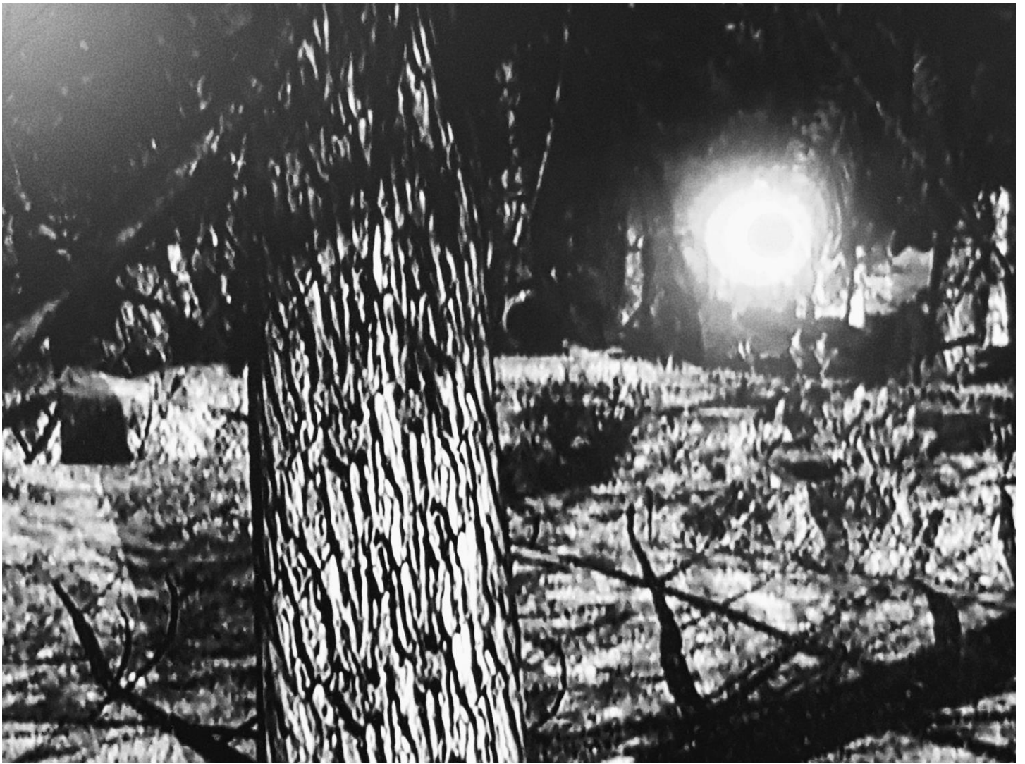
A new 'witness' has released these photos claiming they show the Rendlesham Forest UFO