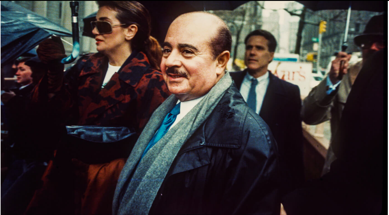
Saudi arms dealer Adnan Khashoggi arrives at Manhattan Federal Court, New York, April 4, 1990.

This connection is even more likely given the fact that Bear Stearns — Epstein's previous employer right up until he became a financial fixer for Khashoggi and other powerful people — also worked directly with BCCI during this period. Indeed, Bear Stearns served as a broker to BCCI, a fact that remained hidden until a lengthy court battle in the U.K. concluded in 2011 and forced the government's "Sandstorm Report" about BCCI's activities to unredact the names of Bear Stearns and other institutions, individuals and countries that had done business with the CIA-linked bank.