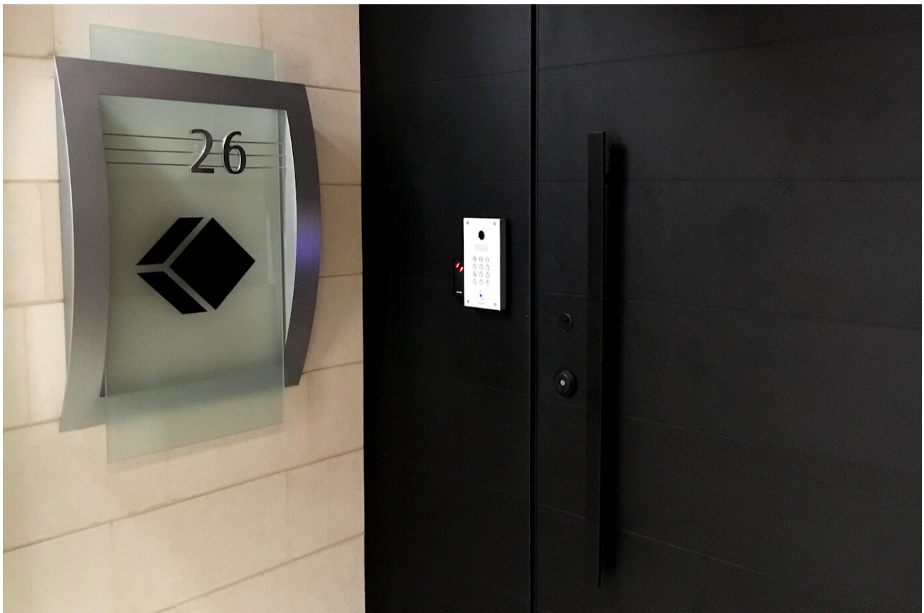
The entrance to Black Cube’s offices on the 26th floor of a Tel Aviv high rise, Feb. 8, 2019.