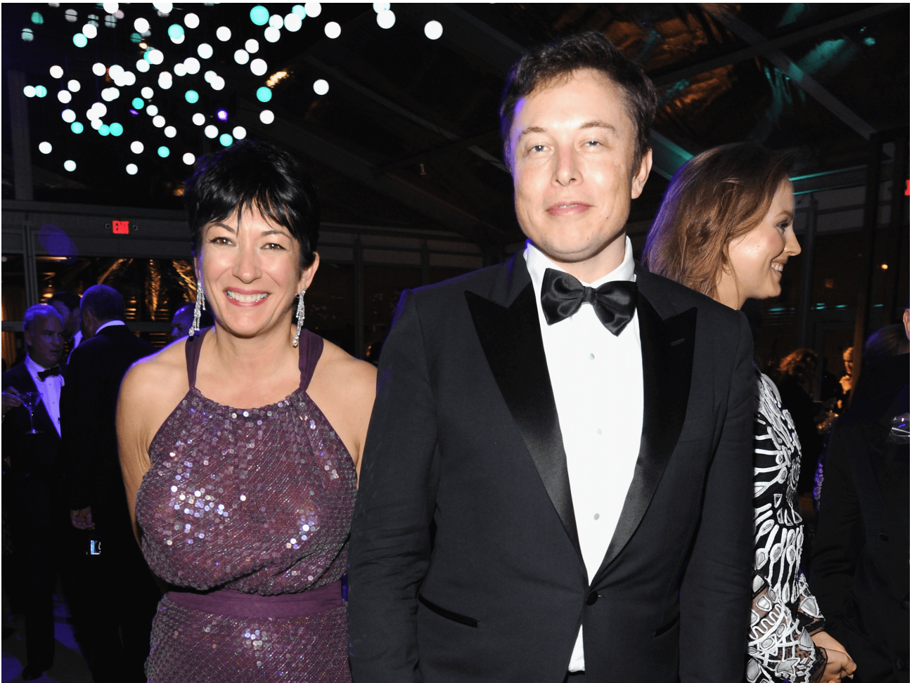
Elon Musk with Epstein's alleged madam Ghislaine Maxwell at an Oscars after-party on March 2, 2014.

Last year, Epstein claimed to be advising Tesla and Elon Musk, who had been previously photographed with Epstein's alleged madam Ghislaine Maxwell. A few years ago, Epstein also attended a dinner hosted by LinkedIn's Reid Hoffman, where Musk had allegedly introduced Epstein to Mark Zuckerberg. Google's Sergey Brin is known to have attended a dinner hosted by Epstein at his New York residence where Donald Trump was also in attendance.