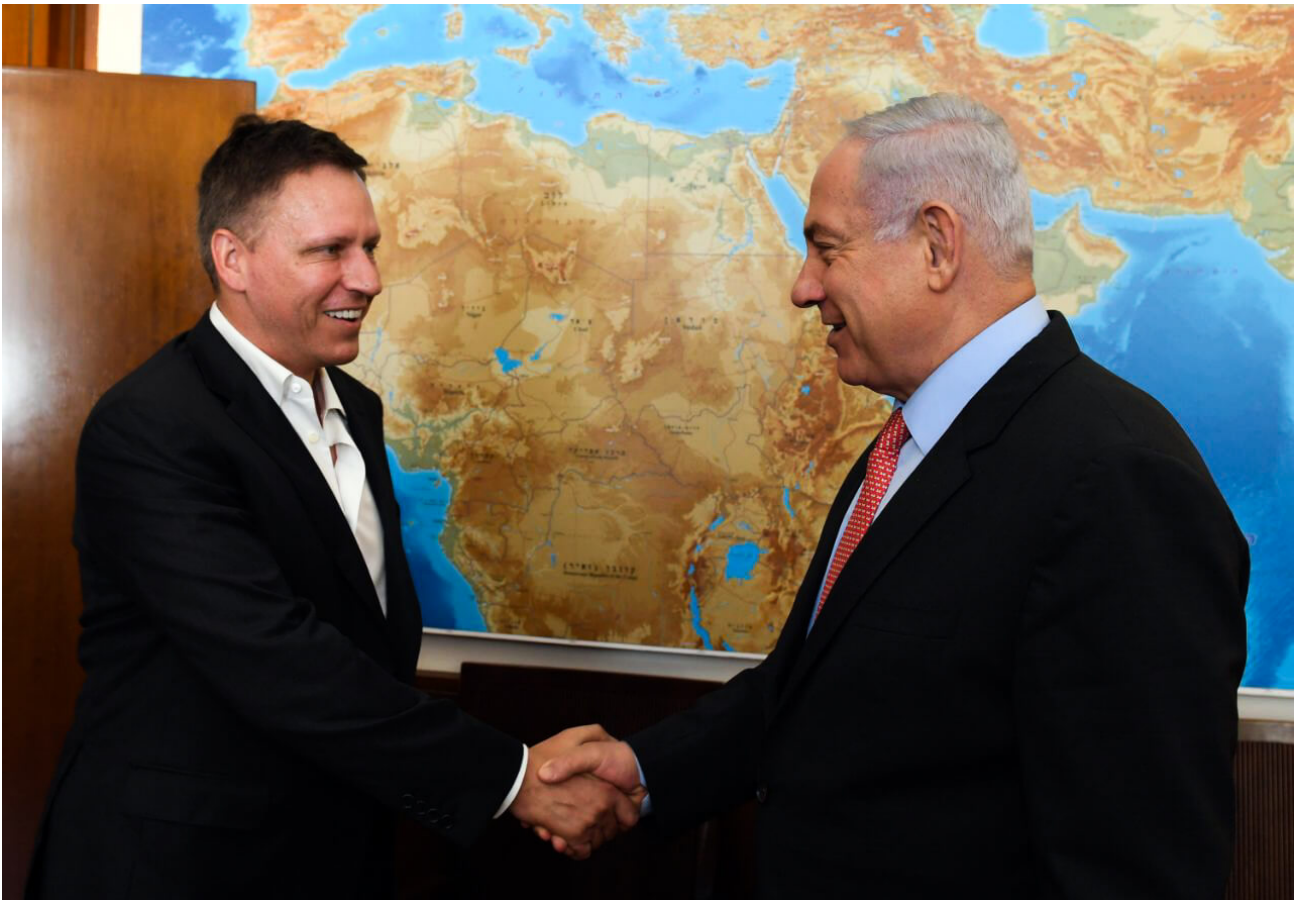
Peter Thiel greets Netanyahu during a 2017 meeting in Israel.