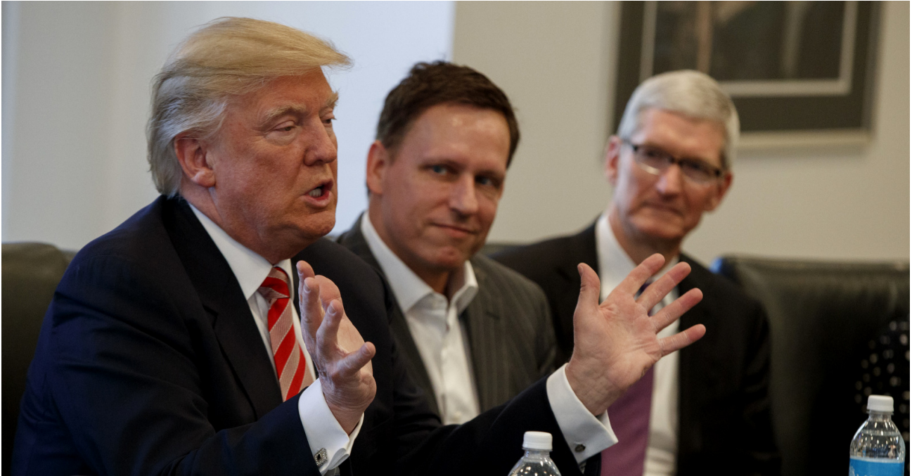
Palantir founder Peter Thiel listens to Trump during a meeting at Trump Tower in New York, Dec. 14, 2016.

run “the highest risk of being involved in gun violence,” according to an investigation of Palantir by The Verge . Furthermore, Palantir’s close ties to the Trump administration make the company’s role in a future nationwide “pre-crime” prevention system based on technology appear inevitable.