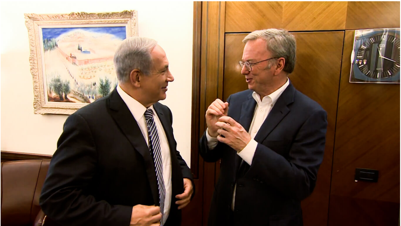
Google Executive Chairman Eric Schmidt meets Netanyahu at his Jerusalem office.

A few months after partnering with Cisco Systems, Carbyne announced its partnership with Google on July 10, just three days after Carbyne funder Jeffrey Epstein was arrested in New York on federal sex trafficking charges. Carbyne's press release of the partnership described how the company and Google would be teaming up in Mexico "to offer advanced mobile location to emergency communications centers (ECCs) throughout Mexico" following the conclusion of a successful four-week pilot program between Carbyne and Google in the Central American nation.