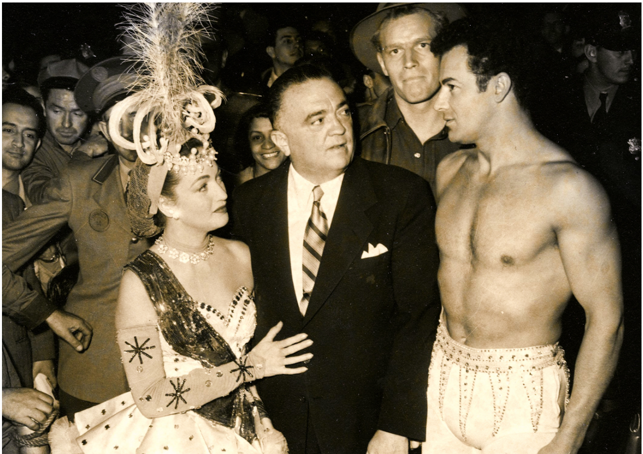
Hoover with Dorothy Lamour on the set of The Greatest Show on Earth in 1951