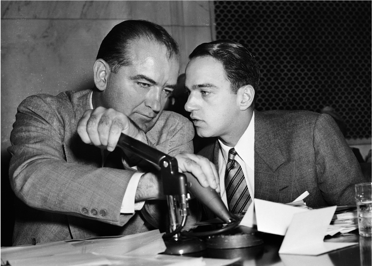
McCarthy covers the mic while having a whispered discussion with Cohn during a 1954 committee hearing.

Once he had made his connection with Hoover, Cohn's star began to rise even higher in Washington. Hoover's recommendation of Cohn would become the deciding factor in his appointment as Sen. McCarthy's general counsel over Robert Kennedy, a rival and bitter enemy of Cohn's.