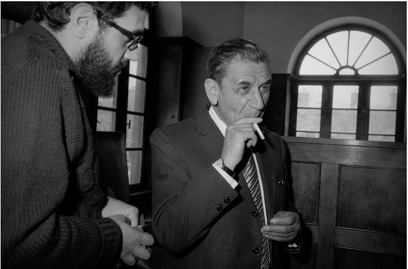
Lansky outside the High Court of Israel where he sought permission to emigrate in 1972.

In addition to the CIA, Lansky was also connected to a foreign intelligence agency through Tibor Rosenbaum, an arms procurer and high-ranking official in Israel’s Mossad, whose bank – the International Credit Bank of Geneva – laundered much of Lansky’s ill-gotten gains and recycled them into legitimate American businesses.