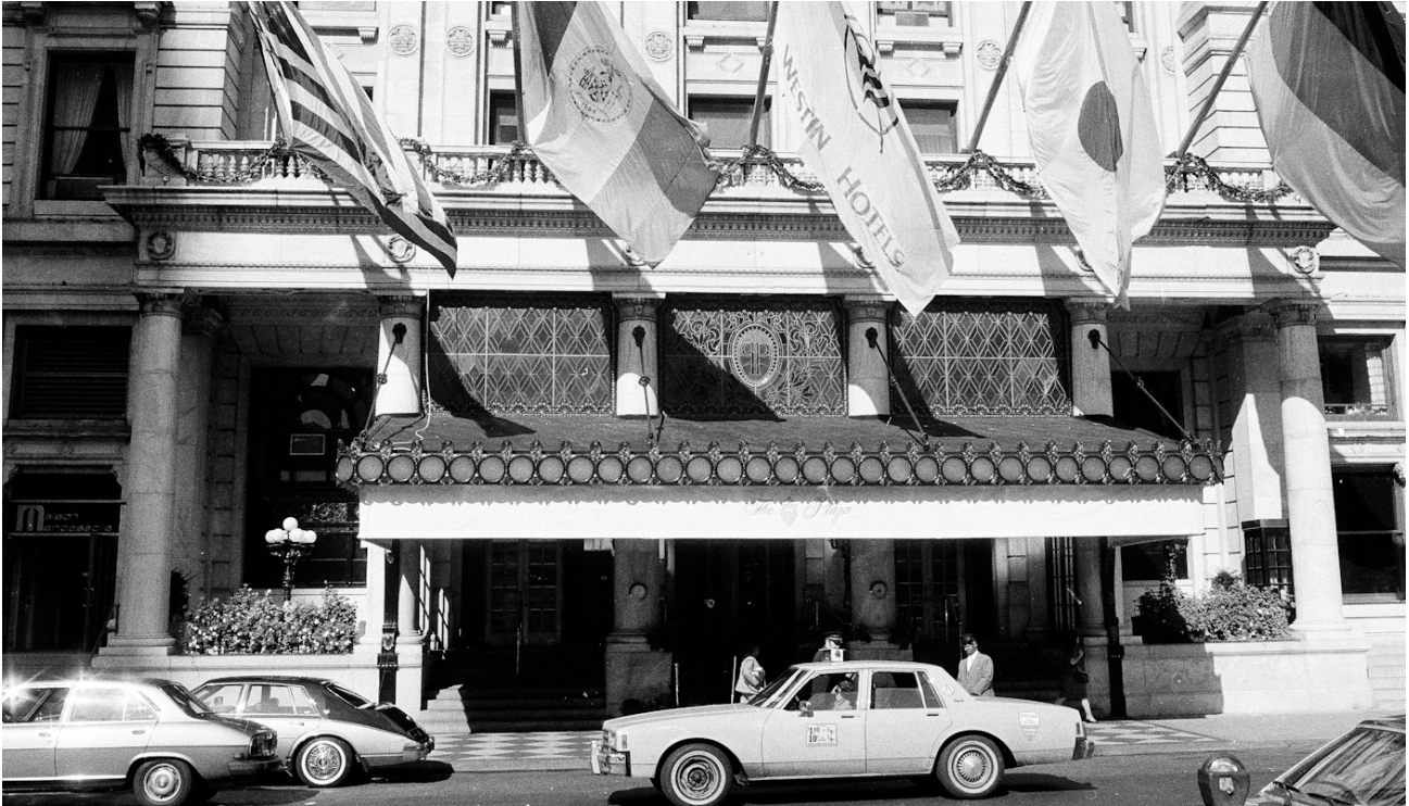
Flags fly over the main entrance of the Plaza Hotel in New York City in 1982.

Rothstein told DeCamp the following about Cohn: