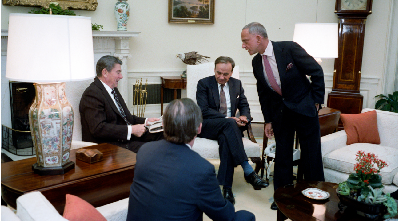
Reagan meets with Rupert Murdoch, U.S. Information Agency Director Charles Wick, and Roy Cohn in the Oval Office in 1983.

While President Trump is clearly connected to both Epstein and Cohn, Cohn's network also extends to former President Bill Clinton, whose friend and longtime political advisor, Richard "Dirty Dick" Morris, was Cohn's cousin and close associate . Morris was also close to Clinton's former communications director, George Stephanopoulos, who is also associated with Jeffrey Epstein.