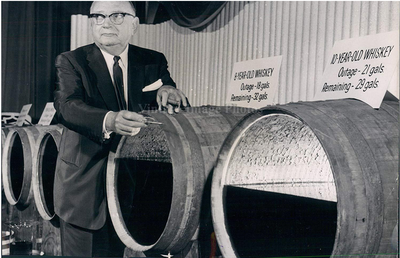
Rosenstiel was connected to both the FBI and to organized crime

Such differences between Bronfman and Rosenstiel were also reflected in their personal lives. While Bronfman married only once and was loyal to his wife, Rosenstiel was married five times and was known for his relatively closeted bisexual antics, a part of his life that was well-known to many of his close associates and employees.