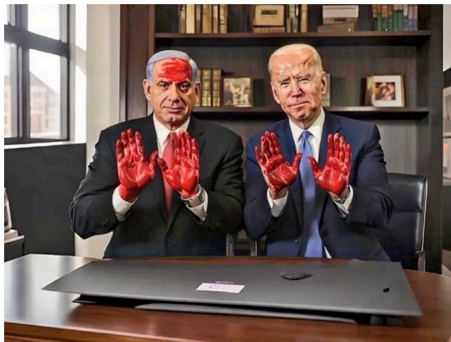
The Genocidaire-in-Chief du Jour

And with Israel's Genocidaire-in-Chief Benjamin Netanyahu now reportedly prepping his next 'sermon' to the Capitol Hill faithful, we can begin cueing the sounds of stomping feet and standing ovations erupting from his devotees at every third syllable this megalomaniacal Zionist Zealot might fulminate from the bully pulpit therein. More delirium in the imperium then? He'll be in good company; along with the president himself Joe Biden and the Beltway Bedlamites™ in general, they're as complicit as he is in said genocide.