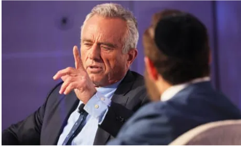
RFK Jr. 'in prayer' with Rabbi Boteach Shmuley on the 'problem of antisemitism'.

hollow, like he'd just returned from a one-on-one mandatory media rehab session delivered personally avec a complimentary 'bitchslaping' by the aforementioned resident ADL 'bovver boy' Greenblatt.