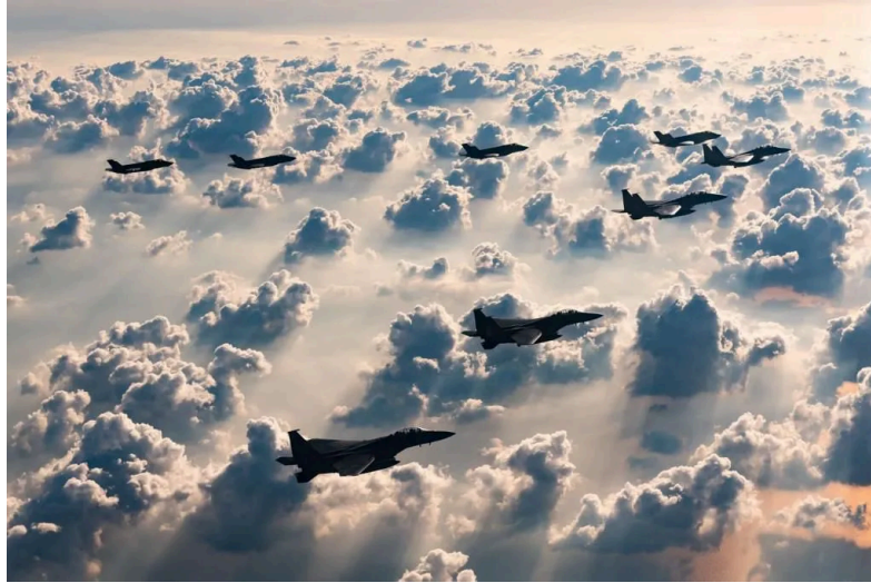
IDF images of the US-Israel joint aerial drills for an attack on Iran