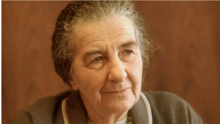
Golda “Mother Israel” Meir, PM, 1969-74

Zionist mythos and the ‘heroes’ that populate it. For that reason alone it was perhaps not going to be greeted well by folks with a more nuanced understanding of Israel’s bloody history of ethnic cleansing and its genocidal politics in general, and Meir’s role in particular in furthering the Zionist agenda.