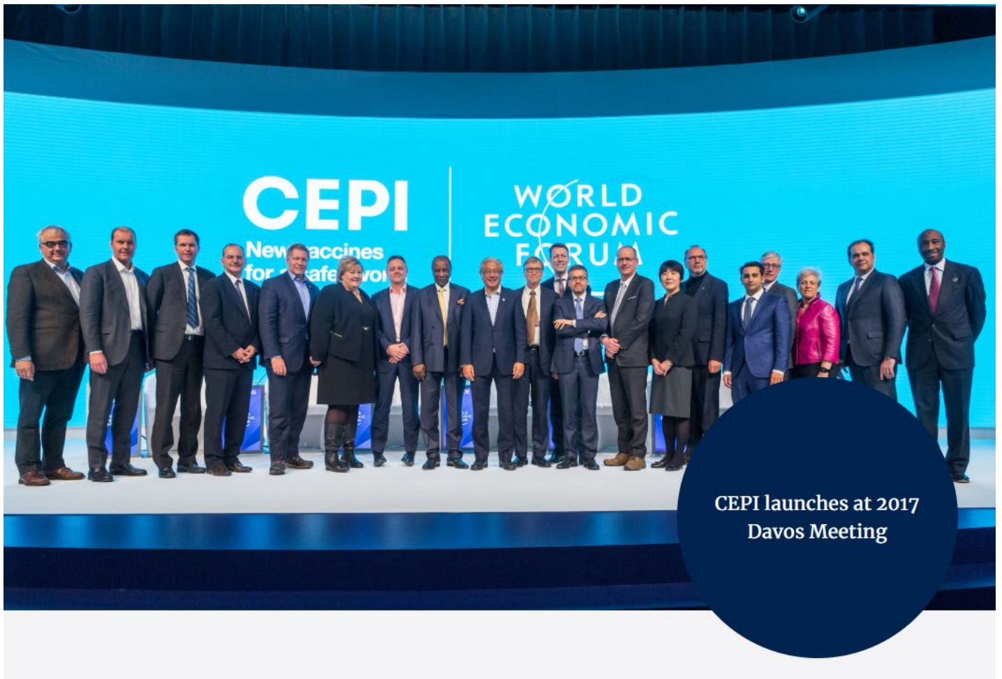
CEPI launches at the 2017 Davos meeting.

Who are CEPI? CEPI is the Coalition for Epidemic Preparedness Innovations. CEPI was launched [33] at Davos in 2017 by the governments of Norway and India, the Bill & Melinda Gates Foundation, the British-based Wellcome Trust global health “charity”, and the World Economic Forum. CEPI is described as an “innovative partnership between public, private, philanthropic and civil organisations”, to which I would add governments: the coalition has received investment from the governments of Germany, Japan, Australia, the UK, Belgium and Canada. Their primary role [34] in relation to Covid-19 is the “development of platforms that can be used for rapid vaccine development against unknown pathogens” (2018).