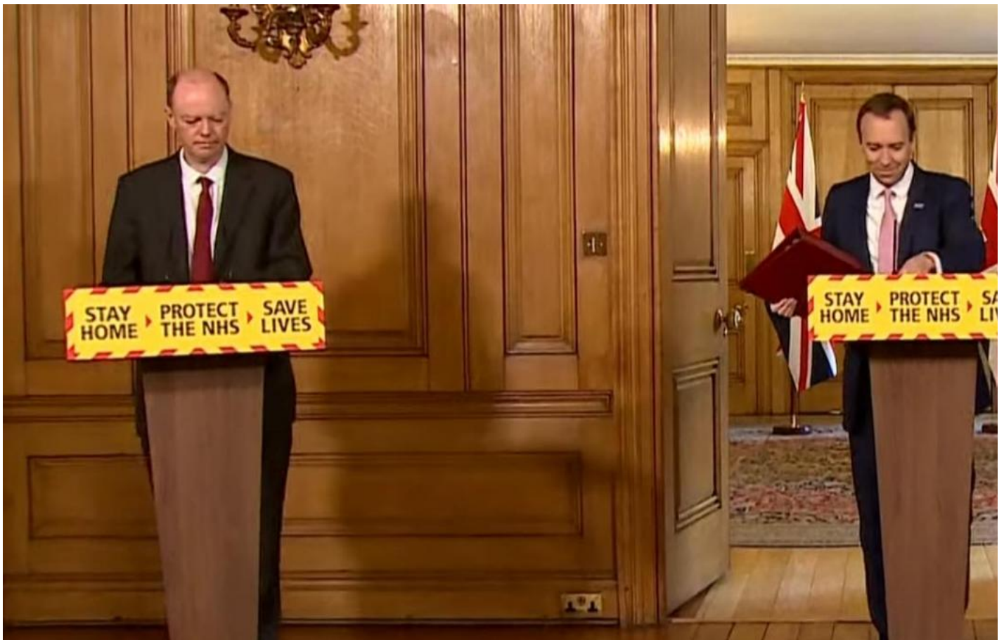
Whitty with Matt Hancock. "The expert we need in the coronavirus crisis." [36]

Whitty also received [36] Gates funding in 2008: $40m for malaria research in Africa. The fact that Whitty was involved in the kick-start of CEPI, Gates' immunisation monopoly project, should therefore not come as a huge surprise.