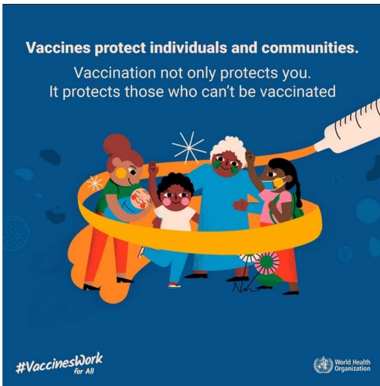
A WHO advertisement for vaccines featured at the World Immunisation Week.

A document produced by Public Health England [51] (PHE) provides a greater insight into how hard the UK Government is promoting vaccines during the Covid-19 “crisis”. The 2020 theme is “Vaccines work for all” — coinciding with the last year of the Gates “vaccine decade” of the 2010s.