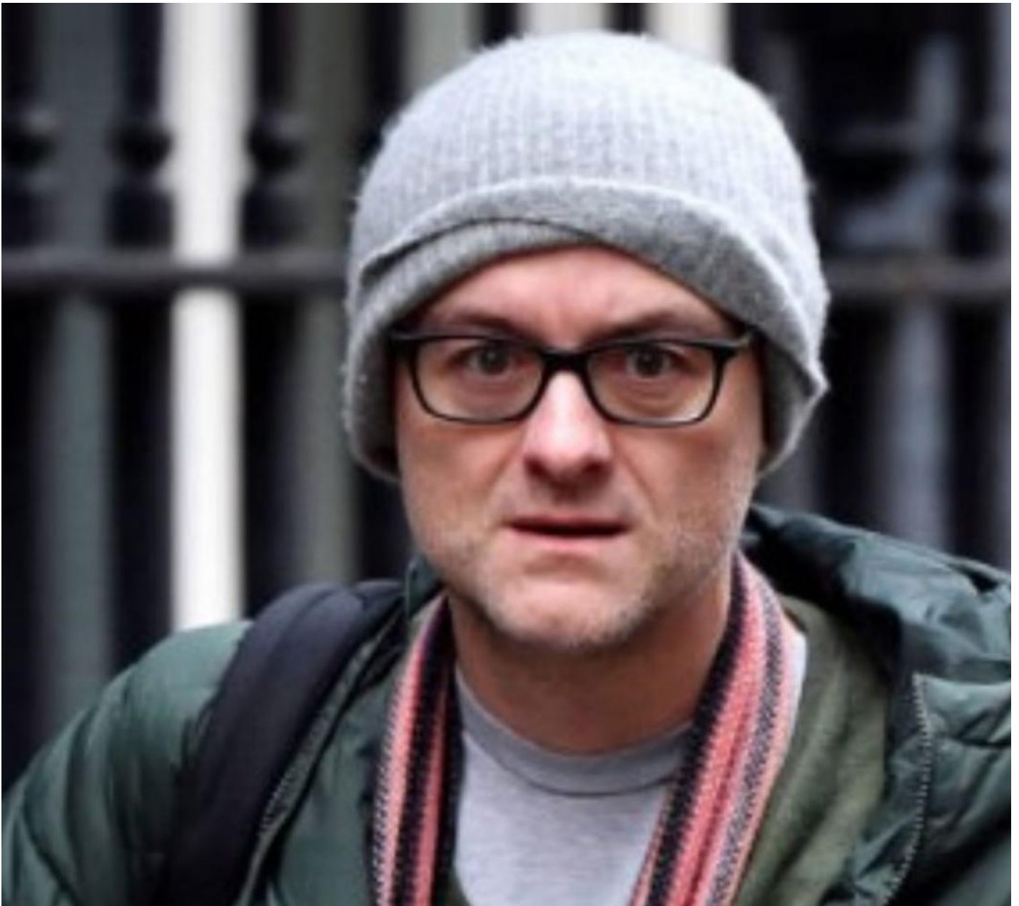
Dominic Cummings

Cummings is accused [77] of pressuring Boris Johnson's advisers to adopt a draconian lockdown policy to combat Covid-19. If this is true, it must raise the question, yet again, of how much the UK Government's policy is influenced by genuine medical expert opinion and how much by commercial, Big Pharma, interests and agendas — interests and agendas which are demonstrably also those of the UK Government.