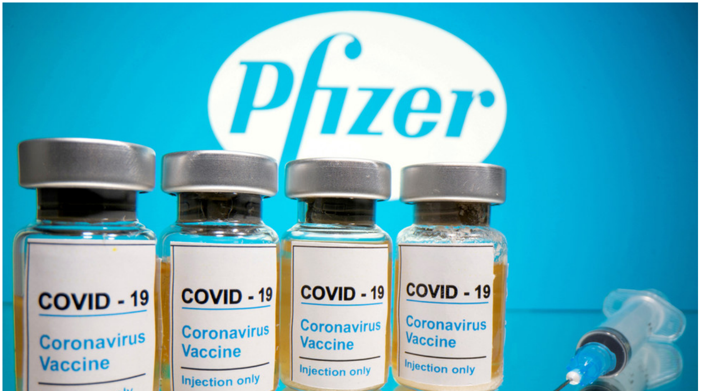
FILE PHOTO. © REUTERS / Dado Ruvic