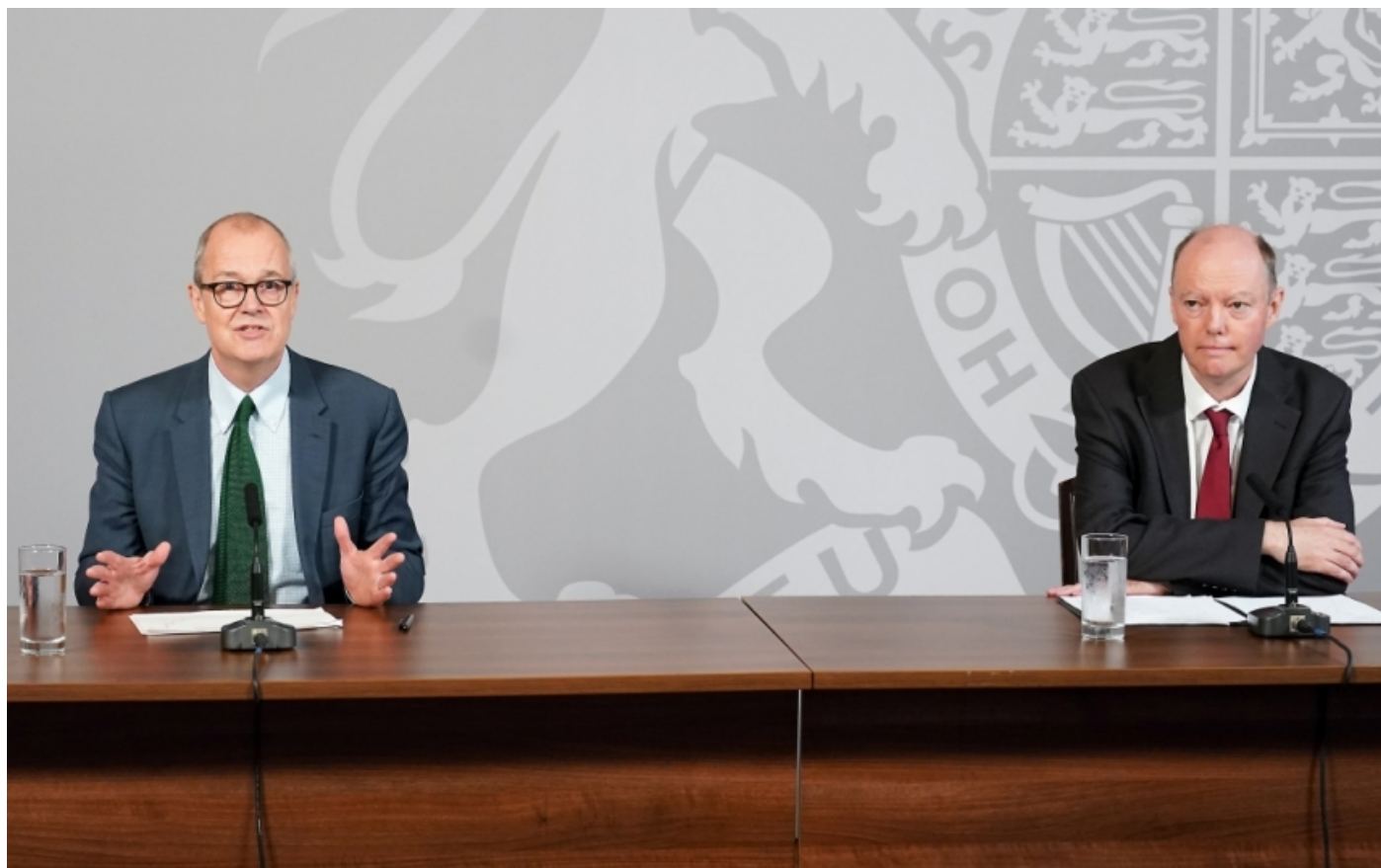
Chief Medical Officer, Professor Chris Whitty, and Chief Scientific Adviser, Sir Patrick Vallance, give a Coronavirus Data Briefing in 10 Downing Street.

“It’s Easier to Fool People Than It Is to Convince Them That They Have Been Fooled.” – Mark Twain