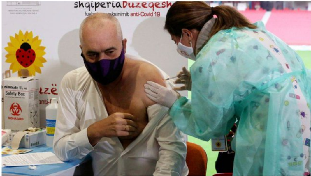
Prime Minister Edi Rama injecting the "PFIZER" vaccine

No vaccine side effects are mentioned but the contract is for what is called a "Reasonable Commercial Effort", which means that the risks involved in the pharmaceutical industry, uncertainties, limitations and challenges of developing, manufacturing, commercializing and distributing the new product are taken into account. of the COVID-19 vaccine, taking into account current factors and issues of potential safety and efficacy, innovation, product profile, ownership position and current competitive environment for such a product.