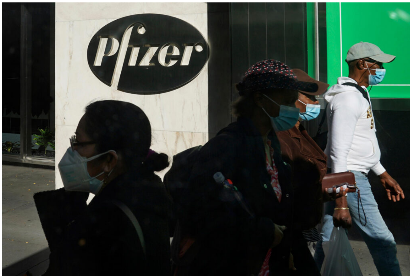
Pedestrians walk past Pfizer world headquarters in New York on Monday Nov. 9, 2020. Pfizer says an early peek at its vaccine data suggests the shots may be 90% effective at preventing COVID-19, but it doesn't mean a vaccine is imminent.

Essentially, the power of the state is being wielded like never before to police online speech and to deplatform news websites to protect the interests of powerful corporations like Pfizer and other scandal-ridden pharmaceutical giants as well as the interests of the US and UK national-security states, which themselves are intimately involved in the Covid-19 vaccination endeavor.